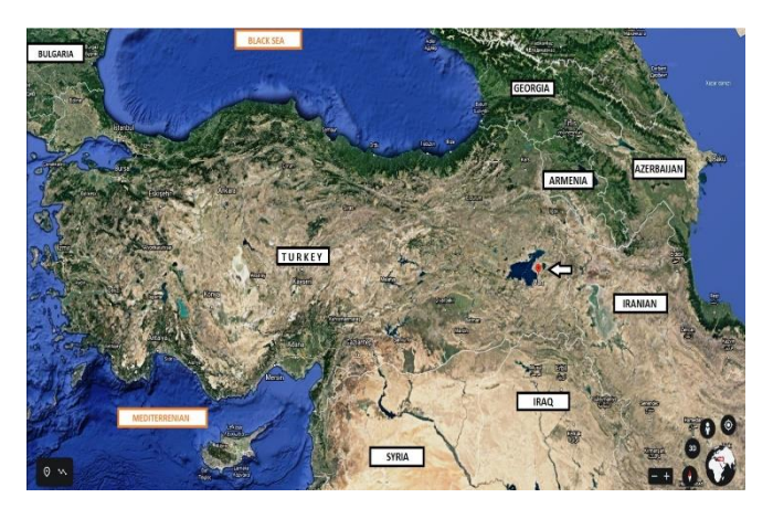
DNA Extraction and Polymerase Chain Reaction

Figure 1. Map of Turkey; The sampling area is indicated by an arrow.