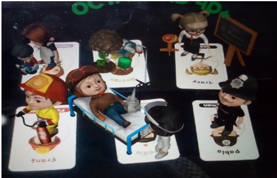
Figure 3 3D Representation of Octaland 4D+ Cards

When the camera detects the cards, the characters specific to the professions are displayed in 3D, and the characters move when the screen is touched. As seen in Figure 3, more than one card can be played at the same time.