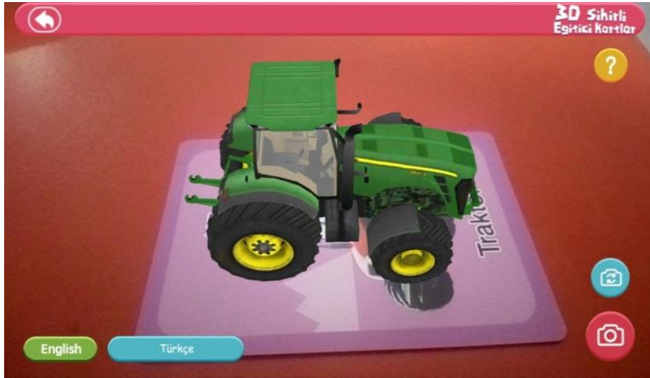
Figure 2 3D Magic Educational Card 3D View

We used this set in the animals and fruits activity of the training given with AR support. When the camera detects the card, animals or fruits can be displayed in 3D and the displayed objects move when the user touches the screen.