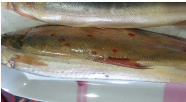
Figure 1. Lernaeciosis with redness, hemorrhage and nodules in body surface of Schizocypris altidorsalis .

Notes: n, fishes infested with Lernaea spp; N, total fishes examined (*P<0.05).