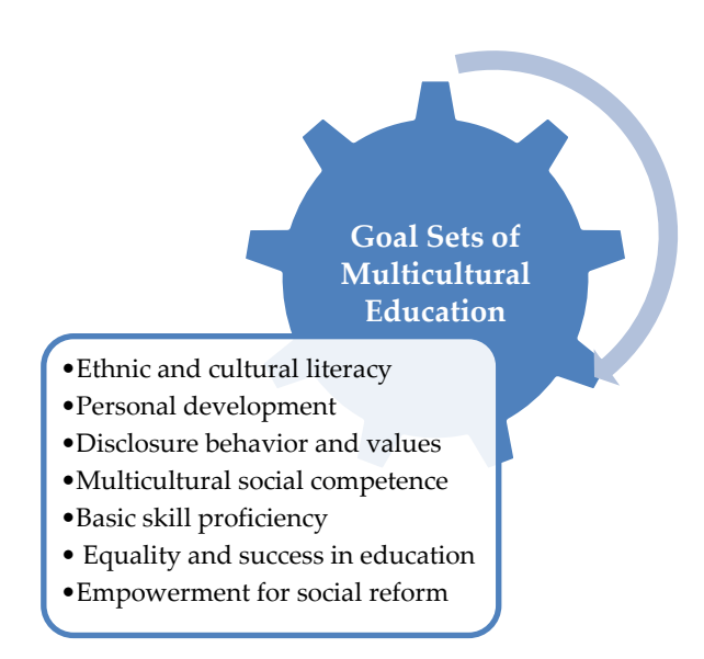
Figure 1. Goals Sets for Multicultural Education (Gay, 1994)