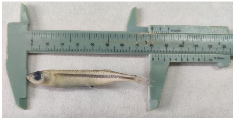
Figure 2. The image of A. boyeri from the Atikhisar Reservoir (Çanakkale, Turkey)

Sampling was conducted during the daytime on June 2021 in Atikhisar Reservoir. The big-scale sand smelt individuals were collected using a beach seine with 10 mm mesh size, 1.5 m long and 1 m high. The sediment was a muddy substrate in the sampling location. Specimens were fixed in formalin. Total length (TL) and weight (W) of A. boyeri individuals were recorded in the Fisheries Histology and Biochemistry Research Laboratory of the Faculty of Marine Sciences and Technology, Çanakkale Onsekiz Mart University in Çanakkale, Turkey. The image of the captured specimen of A. boyeri was provided in Figure 2.