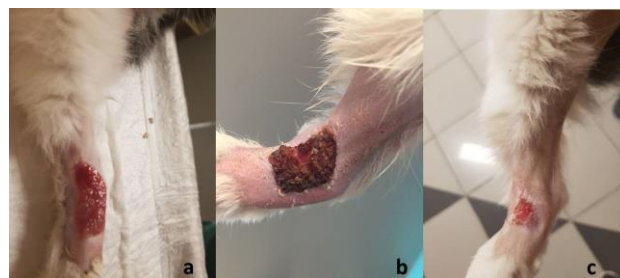
Figure 4: Ozonated water treatment. a: Day 0 of treatment, b: Day 7 of treatment, c: Day 14 of treatment.

tissue protruding from the wound line was formed as a result of long-term ozone application. However, it was determined that this rate was slightly higher in ozonated water applications (Figure 4). Only routine treatment was applied to the patients in the control group.