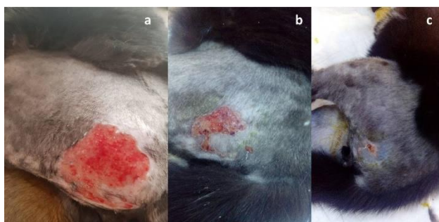
Figure 2. Ozonated oil treatment. a: Day 0 of treatment, b: Day 7 of treatment, c: Day 14 of treatment.

reaction or sensitivity were encountered (Figure 2).