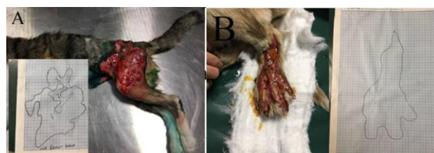
Figure 1. Planimetry for calculation of wound area. A- Wound area calculation in a cat, B- Wound area calculation in a dog.

After obtaining anamnesis information from the owners for the cases included in this study, detailed information was given verbally about the patient's condition, the severity of the event, the treatment to be performed, and the study, and verbal consent was obtained from the owners. In these patients, after shaving around the wound, the wound was washed with saline and cleaned with chlorhexidine gluconate (Biohand Chx Scrub®, Tosel İlaç Sanayi, Türkiye) solution. Wound dimensions were measured and recorded as mm 2 (Figure 1). One of the ozone therapy methods was chosen according to the region of the wounds and the condition of the wound in the animals included in the study. Ozone applications were made in addition to routine wound care in all groups. After the wound was cleaned, ozone was applied according to the group of the patient. The dressing was applied to these patients. Beta-lactamase group antibiotics were administered to these patients as the antibiotic group. Antibiotic administration was applied for 7 days and antibiotic administration was terminated.