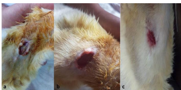
Figure 5. Routine application in the Control group. a: Day 0 of treatment, b: Day 14 of treatment, c: Day 21 of treatment.

When wound closure times and percentages were examined in statistical evaluations, a negative correlation was found between the ozonated oil group and both the control group and ozone bagging group. A positive correlation was determined between antibiotic use and wound healing time in all study groups. Wound healing and closure rate was determined at the highest level, especially in the groups in which ozonated oil was applied. There was no statistically significant relationship between ozone bagging and the control group as a local application (Figure 5).