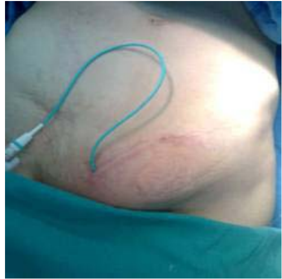
Figure 2: Left sided swelling of groin at the seventh day of lymphocele treatment