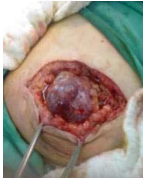
Figure 3: Left groin hernia sac