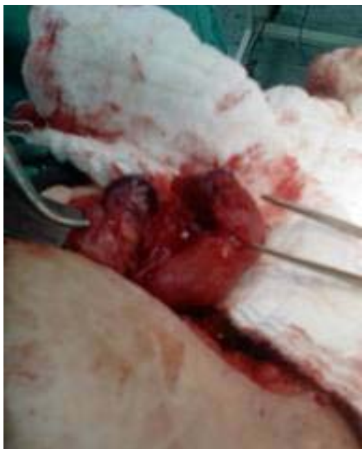
Figure 5: At exploration the ovary or fallopian tube were in the hernia sac