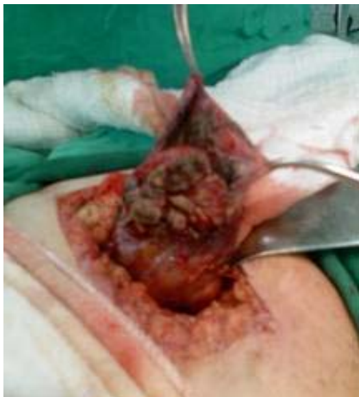
Figure 4: The contents of the sac were ischemic, necrotic and edematous