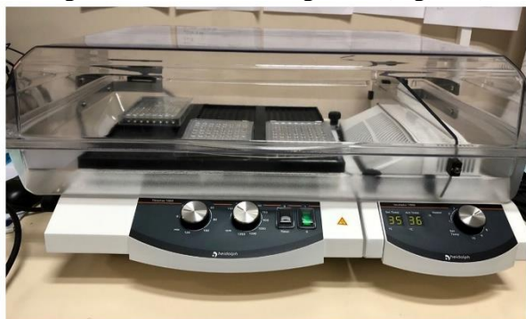
Figure 1. Incubation of nettle extracts in the shaking incubator

were determined, 10 microliter passages were made on a 5% sheep blood agar medium and incubated for another 24 hours. MBC values were determined by detecting the last well without growth (Figure 2).