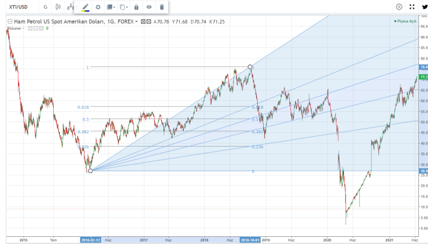
FIGURE 8. Technical Analysis of Oil Prices with Fibonacci Fan

As seen in the Figure 8, oil prices are analyzed with the ratios obtained from 23.6%, 38.20%, 50% and 61.8% Fibonacci sequence. According to this, it is seen that the 38.20% level is an important support point. It is seen that the other levels are not taken into account by the market too much. Nickel Fibonacci fans and Fibonacci fans are examined separately in Figure 7 and Figure 8 on the same graph. When these two figures are compared, it is seen that the fans created using Nickel ratios are considered more as support and resistance than the golden ratio. From an economic point of view these results show that Nickel Fibonacci fans is useful in technical analysis like Fibonacci fans while making investment decisions.