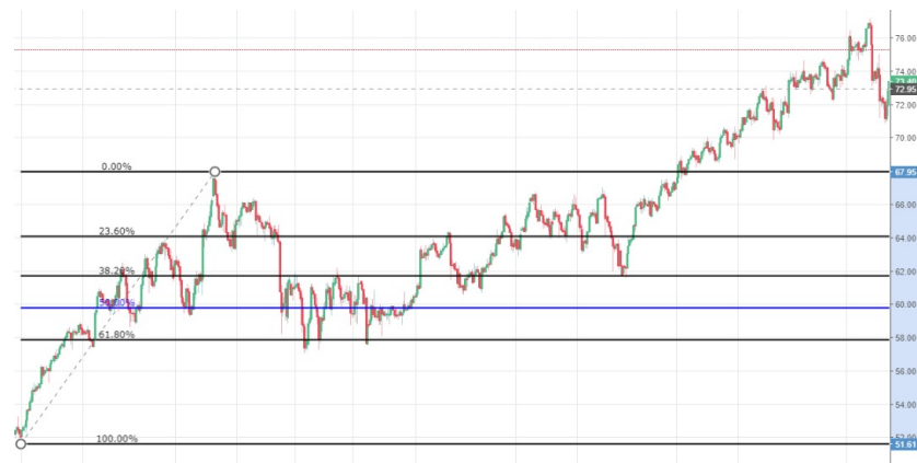
FIGURE 6. Technical Analysis of Oil Prices with Fibonacci Retracement in a Uptrend

4.2. Technical Analysis of Oil Prices with Nickel Fibonacci Fan. The difference between trough and peak point of the upward or downward trend on the graph consisting of Nickel ratios considered in the study and oil prices is taken into account. The starting of trend indicates level of zero while its end point indicates level of 1. After, tangential lines are drawn to Nickel ratio levels based on zero point. These lines are accepted as support and resistance levels, just like Fibonacci fans. Figure 7 shows the example reflecting the so-called situation.