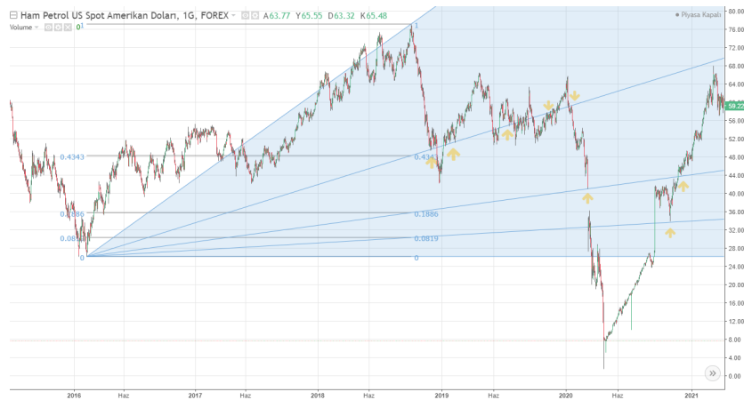
FIGURE 7. Technical Analysis of Oil Prices with Nickel Fibonacci Fan