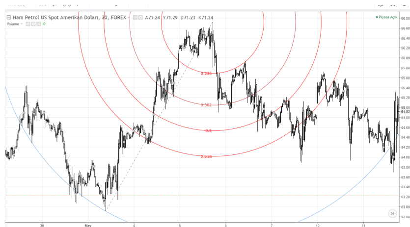
FIGURE 10. Technical Analysis of Oil Prices with Fibonacci Arcs

Figure 10 shows a graph of 30-minute periods between May 3, 2021 and May 5, 2021. There is an upward trend as seen in the chart. While the crude oil price is $62.91 at the bottom of the trend, the crude oil price is $66.72 at the peak of the trend. In the arcs drawn from these levels, it is seen that the level formed with the Fibonacci ratio of 23.60% from the point where the trend returns, acts as a support. Afterwards, it is seen that the same level is an important resistance point.