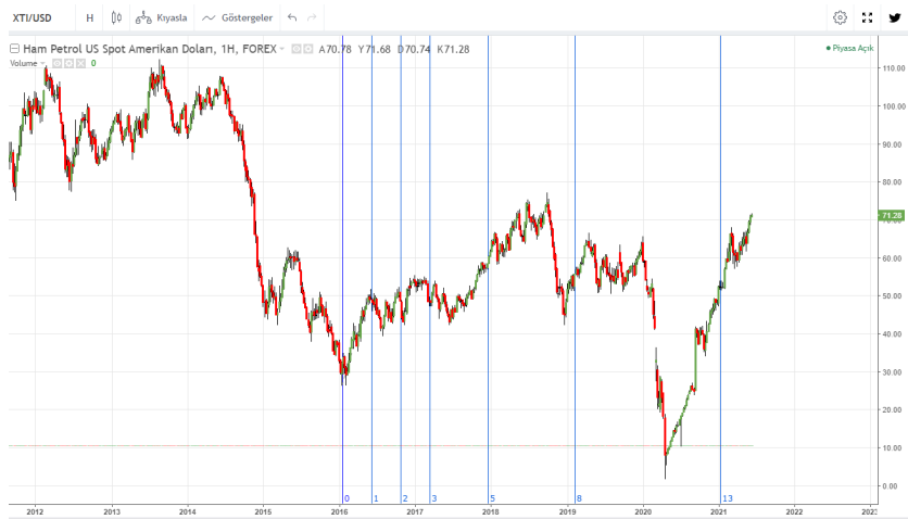
FIGURE 12. Technical Analysis of Oil Prices with Fibonacci Time Zones

In the Figure 12, there is a graph consisting of weekly periods between 18 January 2016 and 6 June 2021. As seen in the graph, using Fibonacci number sequences continuing as 0, 1, 2, 3, 5, 8, 13, ... spaces are created with blue vertical lines on the determined points. As in Nickel Fibonacci sequences, it is seen that the vertical line created by using Fibonacci sequences at some points changes direction immediately after the levels it is in and moves rapidly towards the opposite direction. At some points, it moves in the same direction without changing any direction.