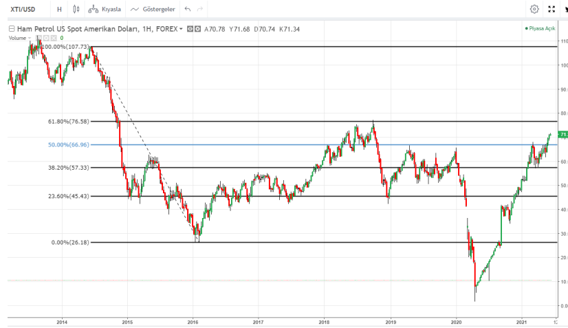
FIGURE 4. Technical Analysis of Oil Prices with Fibonacci Retracement in a Downtrend

The critical levels determined as a result of the calculations are shown in the Figure 3. When the Figure 3 is examined, it is seen that the 18.86% ratio obtained from the Nickel Fibonacci number sequence is an important reversal point as support and resistance. On this figure, oil prices turn back 10 times from levels close to 41.56 dollars, which corresponds to 18.86%. Also, it is seen that 43.43% and 8.19% of the Nickel Fibonacci sequence are considered as support and resistance, although they are not as effective as 18.86%.