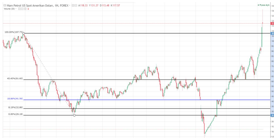
FIGURE 3. Technical Analysis of Oil Prices with Nickel Fibonacci Retracement in a Downtrend

While an upward trend continues, possible retracement levels are determined as respectively 8.19% (C), 18.86% (D) and 43.43% (E) of the difference between the points A and B, as expressed in the downward trend. The ratios which will be used in the formation of an upward trend are shown in Figure 2. Within the scope of this information, the retracement levels developed by using Nickel ratios in the weekly period oil graph are examined in Figure 3.