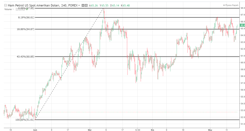
FIGURE 5. Technical Analysis of Oil Prices with Nickel Fibonacci Retracement in a Uptrend