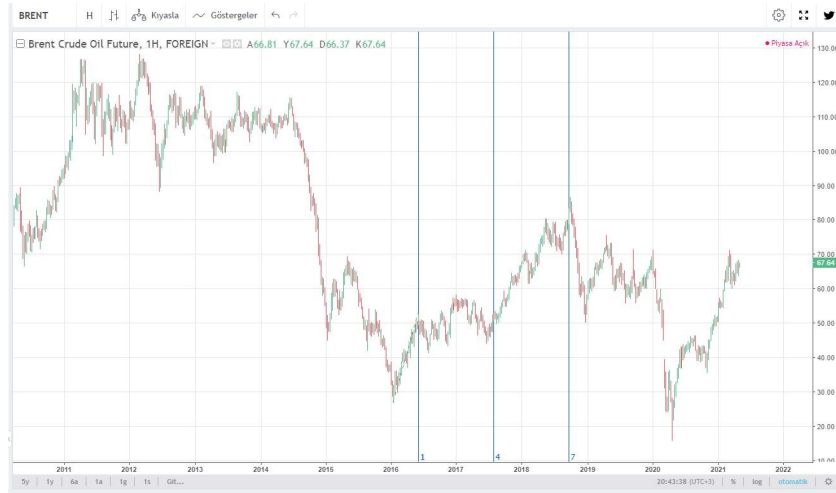
FIGURE 11. Technical Analysis of Oil Prices with Nickel Fibonacci Time Zones

by drawing a line from the bottom to the top or from the top to the bottom. In the study, Nickel Fibonacci time periods are determined on the crude oil graph created with 1–week intervals, and the graph created is as follows.