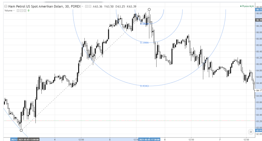
FIGURE 9. Technical Analysis of Oil Prices with Nickel Fibonacci Arcs

In Figure 9, it is seen a graph of 30-minute periods between the dates of May 3, 2021 and May 5, 2021. As seen in the graph, there is an upward trend. While the crude oil price is $62.91 at the bottom of the trend, the crude oil price is $66.72 at the peak of the trend. In arcs drawn from these levels, it is seen that from the point where the trend immediately turns the level formed with a Nickel rate of 8.19% in the first half hour assumes a support role in the determined range. After that it is seen that the 18.86% level was broken and immediately after this break, the 18.86% became resistance level. Next, it is seen that the arc which corresponds to the level of 43.43%, play role first as a support and then as a resistance.