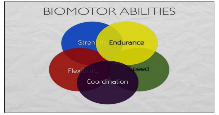
Figure 1. Bio-motor abilities (Bompa, 1994).