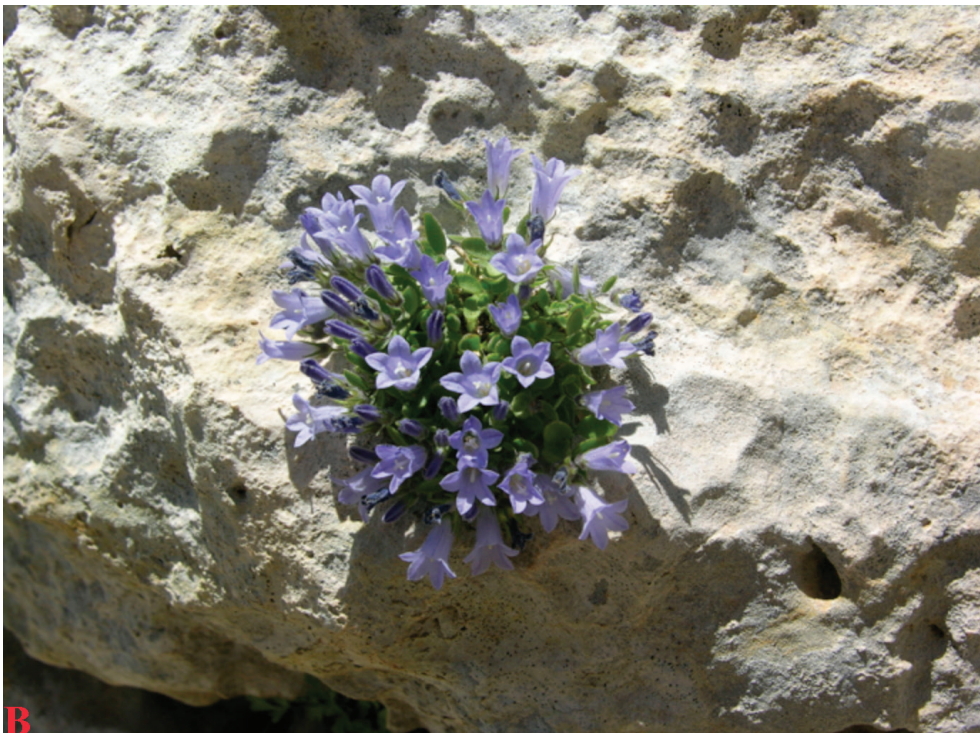
Figure 3. A, B- Habitus and habitat of C. myrtifolia var. caerulea .