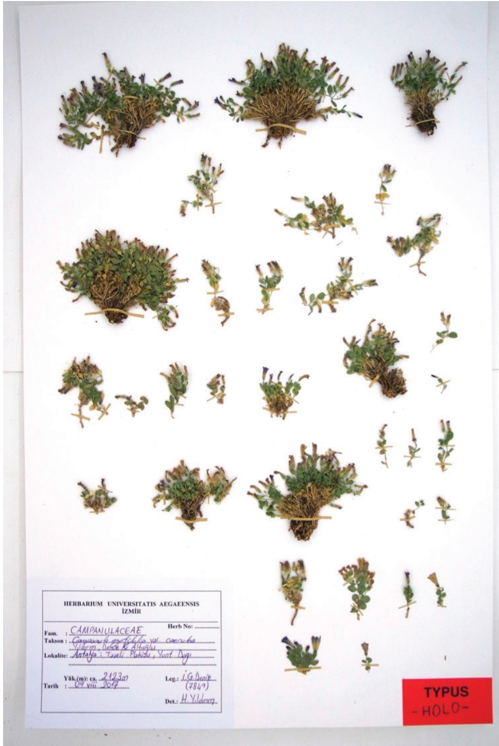
Figure 2. Holotypus of C. myrtifolia var. caerulea .

Additional specimens examined (paratypes): Antalya: Gazipaşa, Çayırakası plateau, 1700 m, 19 vii 1983, H.Sümbül 2326 (HUB!); Gazipaşa, Çobanlar village plateau, Delieğrik, rocky places, 1700-2000 m, 19 vii 1981, H.Sümbül 1075 (HUB 26156!).