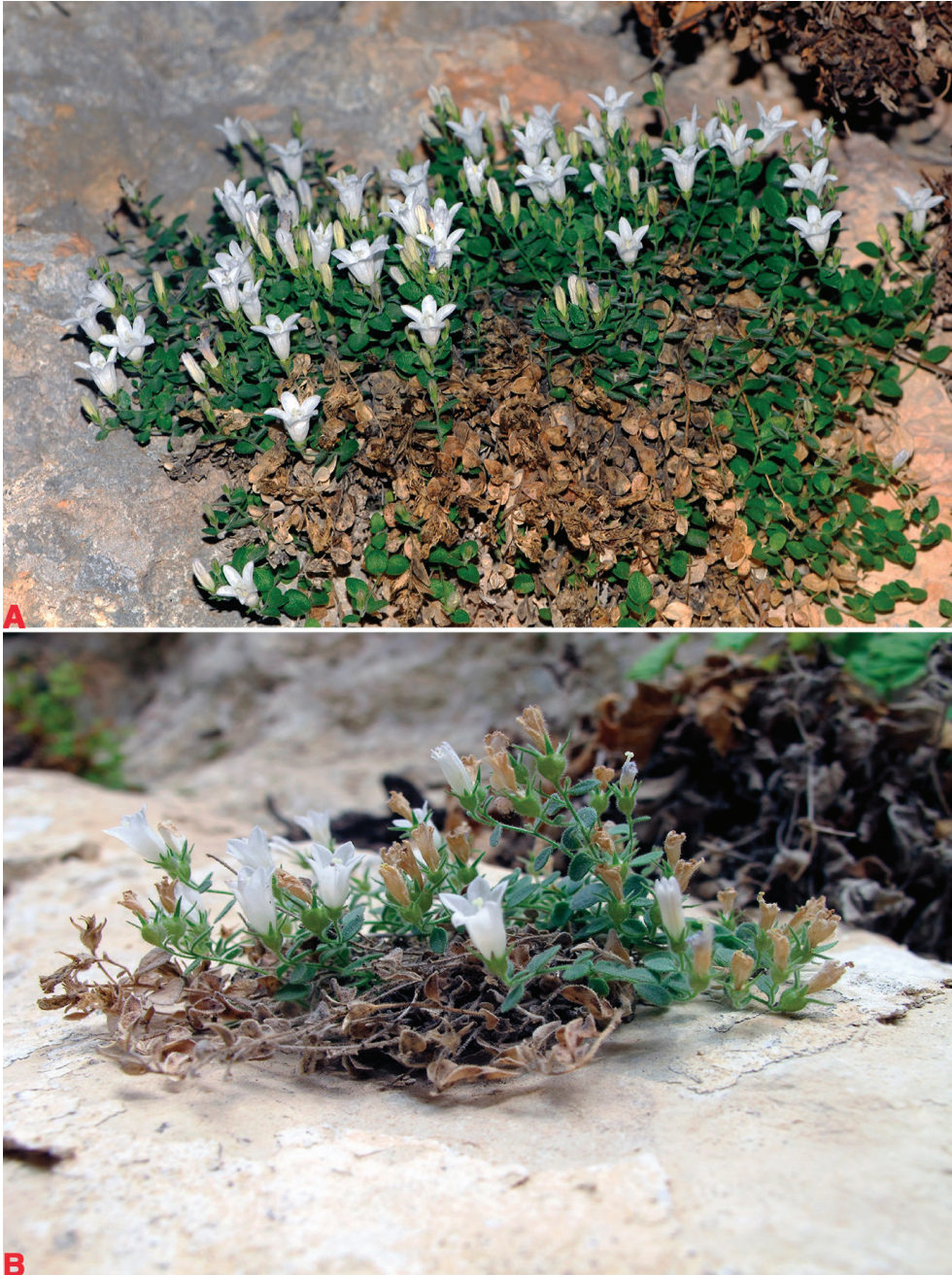
Figure 4. A,B- Habitus and habitat of C. myrtifolia var. myrtifolia .

Tracheliopsis have small flowers with clearly exerted styles. The type locality of C. myrtifolia is the Ermenek district in Karaman province. During field studies around Ermenek, we realized that the populations of C. myrtifolia have white flowers (Figure 4). Although Damboldt (1978) stated that C. myrtifolia has lavender-blue to sometimes white flowers, we observed only white flowered individuals near the type locality. It is probable that Damboldt examined only dry specimens of C. myrtifolia . During field studies, we realized that at the end of flowering periods, the white flowered taxa of sect Tracheliopsis turn slightly bluish in color. For this reason, it