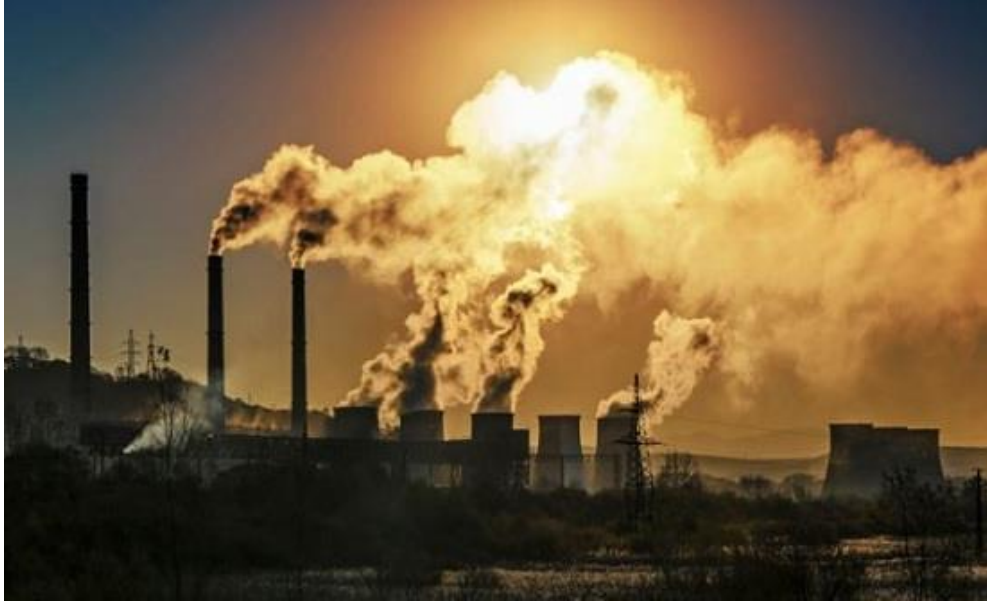
Fig. 2. Air pollution in Jordan - expressive.