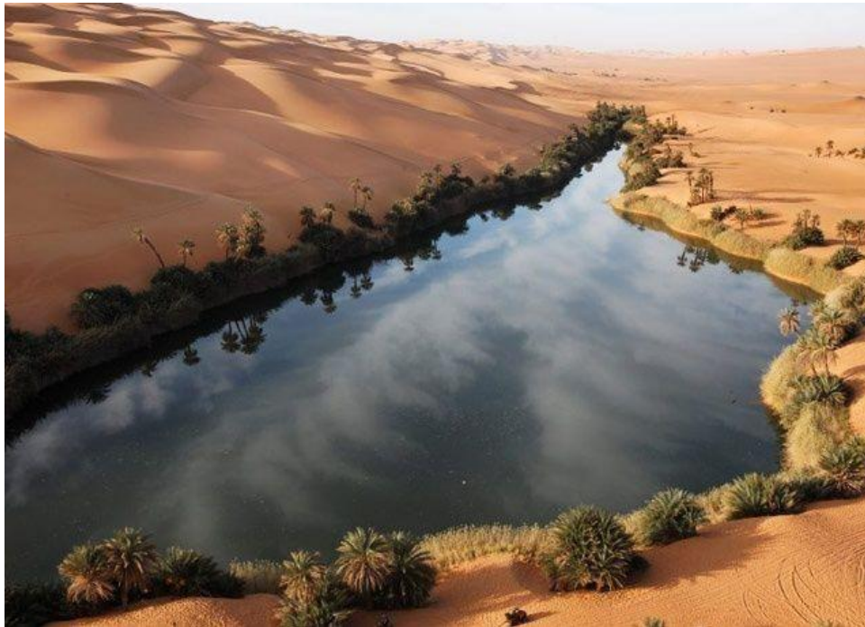
Figure 7: Disi aquifer.

Many desert and semi-desert areas developed underneath the surface of aquifers due to periods of arid climate in the past, and they are referred to as fossil waters, with the Disi groundwater being one example (Figure 7). The Disi groundwater is the largest in the Peninsula of Arabia and one of Jordan's water sources, but it is subject to various restrictions (Andersen et al., 2017). Disi water can be used in the southern area because it is the nearest and least costly to transport, but it must using cautious because it is a non-renewable resource.