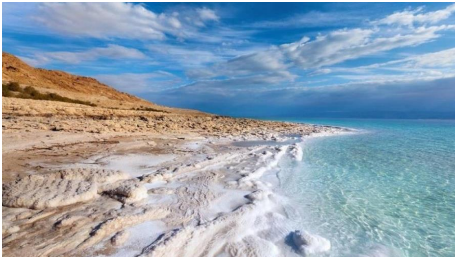
Figure 6: The Dead Sea water level continues to drop.