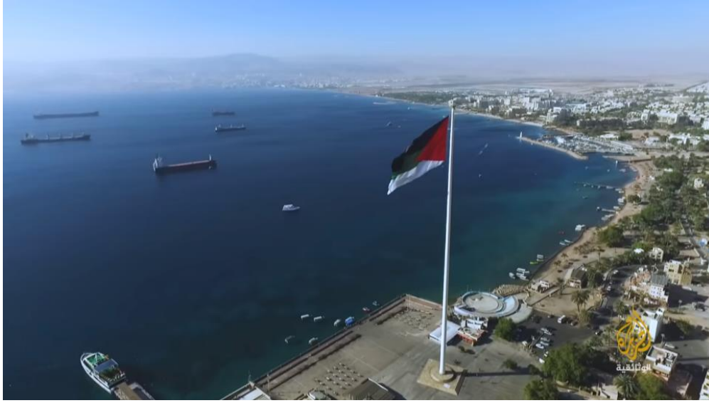
Figure 4: Aqaba Port.