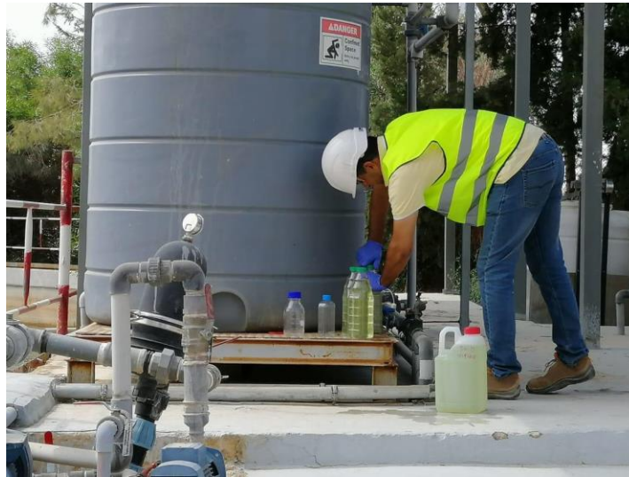
Figure 8: Water sources

Important initiatives have arisen due to the introduction of environmental legislation in response to the needs of the place and time, such as the conference on maintaining landscapes, which resulted in the power plant's work is halted. The Environmental Protection Agency (EPA) is the source of most environmental legislation, consisting of forty laws and numerous regulations. Services for certain facilities provided by other federal organizations (wildlife, parks, forests, land administration) (Tarlock, 1979).