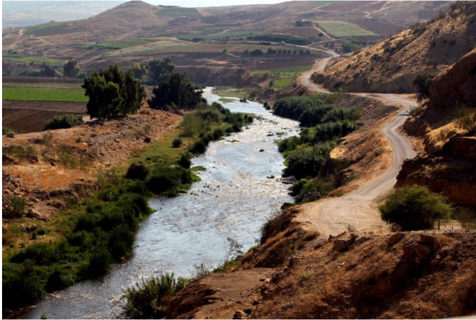
Figure 3: Zarqa River exposed to wastewater flow.