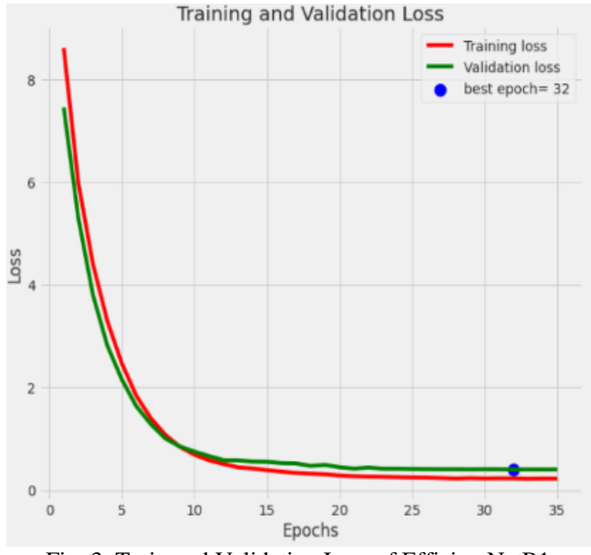
Fig. 3. Train and Validation Loss of EfficientNetB1

In Table 3 and Table 4, the use of balanced dataset seems to give better results in models. An average of 2% increase can be seen in the EfficientNetB1 model, which has the highest accuracy and f1-score value. There is an increase in other models as well.