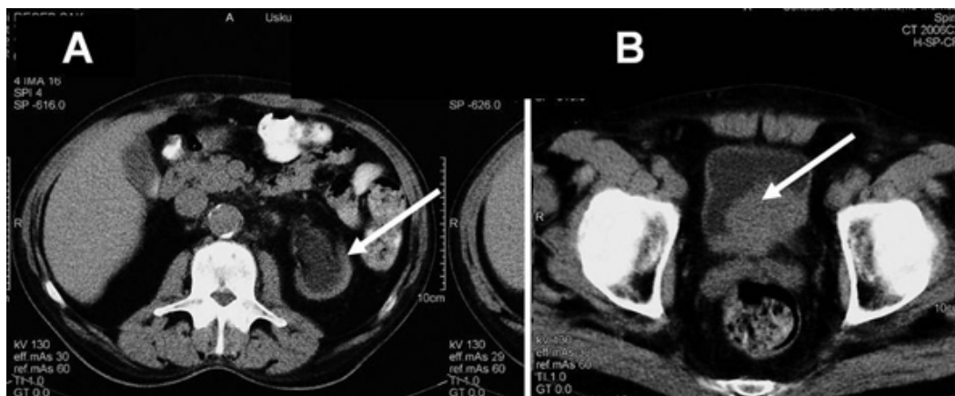
Figure I A-B: CT scan of kidney and bladder

A pathology report revealed a synchronous triple tumor in the kidney, urinary bladder and prostate. The kidney pathology revealed a 1.2 cm tubular-type clear cell renal cell carcinoma at the left lower pole, pT1N0 with Fuhrman Grade 2. Bladder pathology revealed a high-grade invasive urethelial carcinoma with carcinoma in-situ, stage PT2bN0. Prostate pathology revealed a prostatic adenocarcinoma composed of small atypical glands with a Gleason score of 3+3 (Figure IIA-B-C). This diagnosis was confirmed by negative staining of the neoplastic glands with high molecular weight cytokeratin immunohistochemistry (34E12). The lymph nodes were tumor free. Control MRI sections did not reveal any tumor recurrences or late complications during the follow-up period of the patients and he did not receive any adjuvant treatment modality.