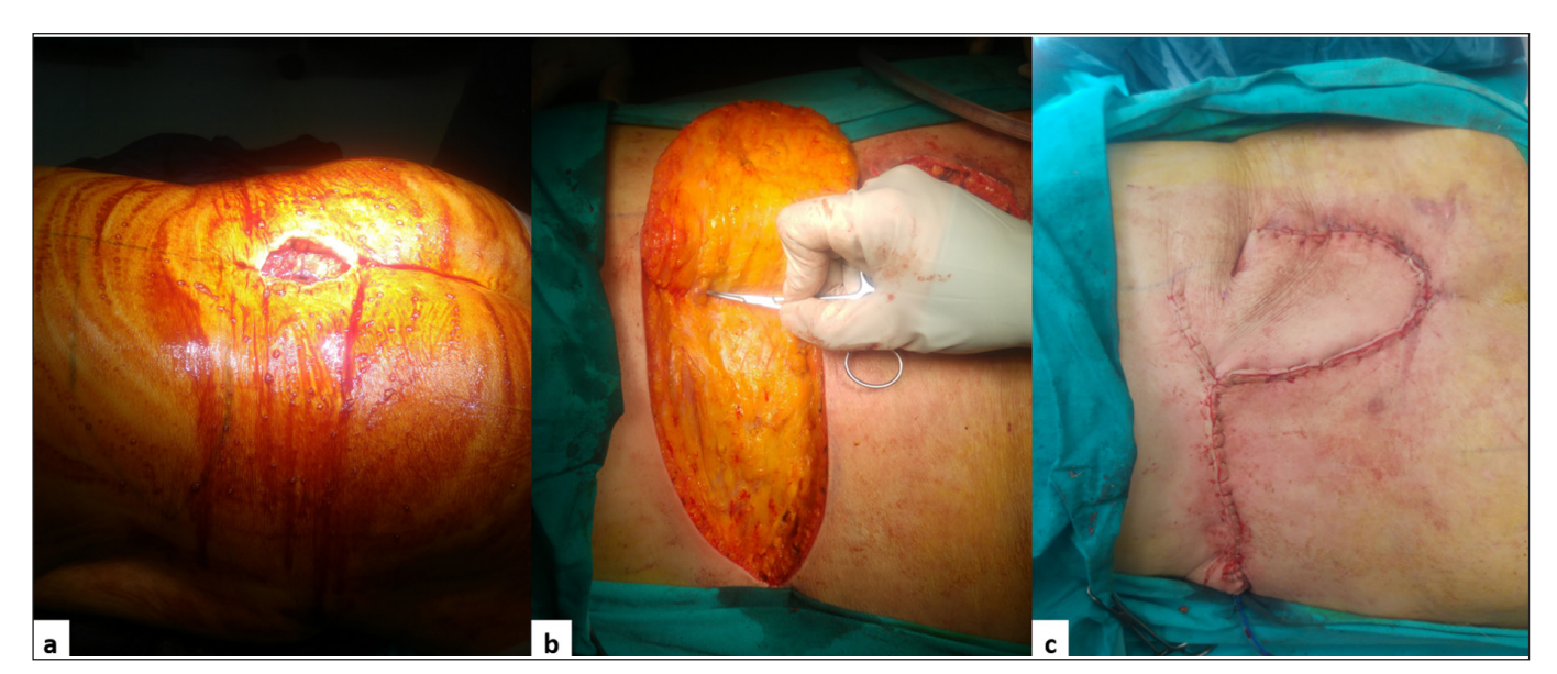
Figure 3 a. Lomber defect after neurosurgical procedure b. Flap elevated on one perforator shown at the tip of the clamp c. After closure