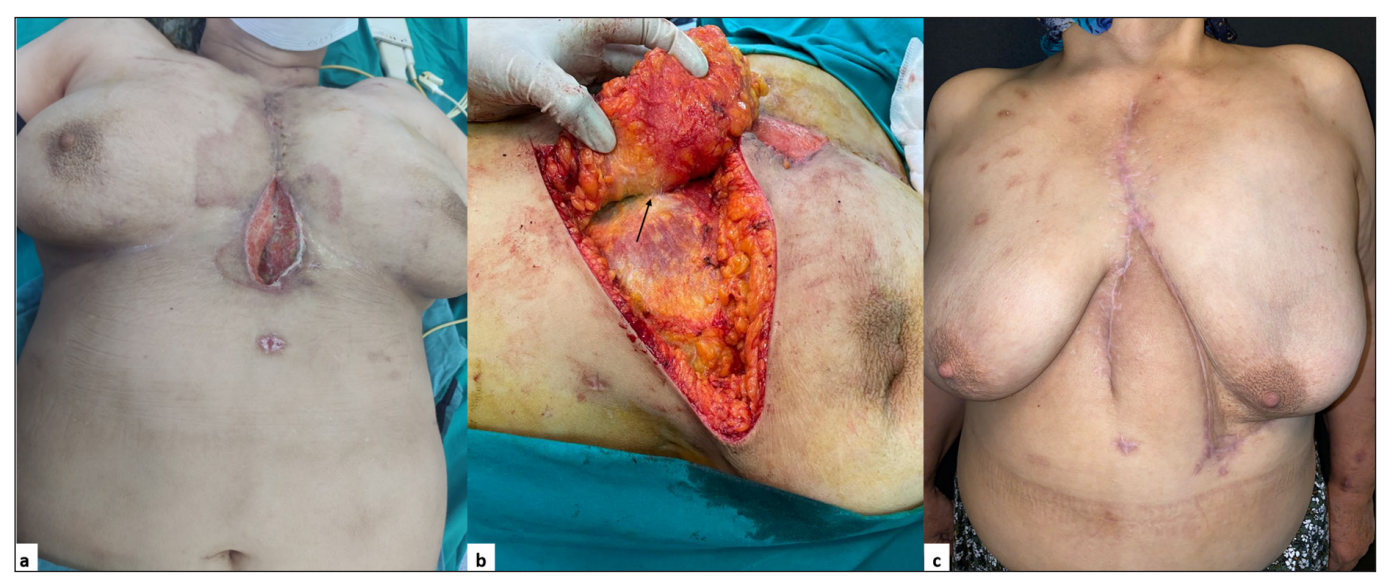
Figure 1a. Sternal wound dehcicence after coronary artery bypass surgery b. Perforator based transposition plus flap, arrow shows perforator from internal mamarian artery, which is visualised but not dissected intramusculary. c. Postoperative 4 months