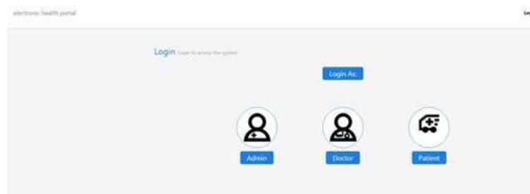
Figure 2. First page of ehp

The user appears in front of three logging options as shown in Figure 2 administrator, doctor, and patient. The interface contains the electronic health portal’s name and some details about the institution (such as the name of the institution, private phone numbers, and the location). Access to any of these sections is through a username and password that the portal administrator creates.