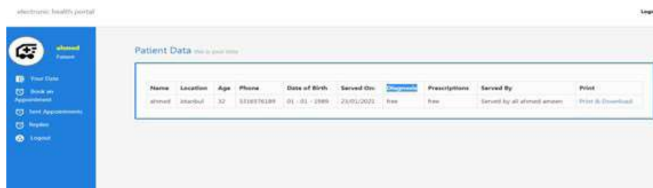
Figure 4. patient block diagrams

When the patient logs into the electronic health portal through the phone number and password previously set by the system administrator, five options for the patient will appear as shown in the Figure 4.