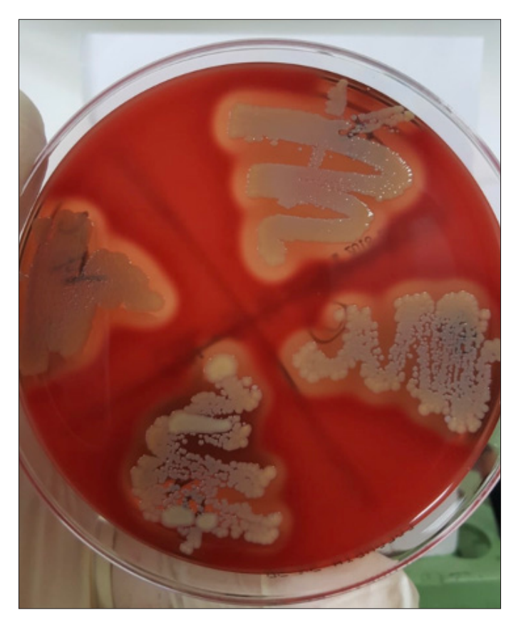
Figure 1. S. aureus colonies

S. aureus was detected in 3 of the 76 (3.9%) preclinical students who did not treat patients, and in 16 of 76 (21.1%) of the clinical students who attended to patients. MRSA colonization was not found in any group. There was a statistically significant difference in the prevalence of S. aureus (P = .003, P < .05) (Figure 3).