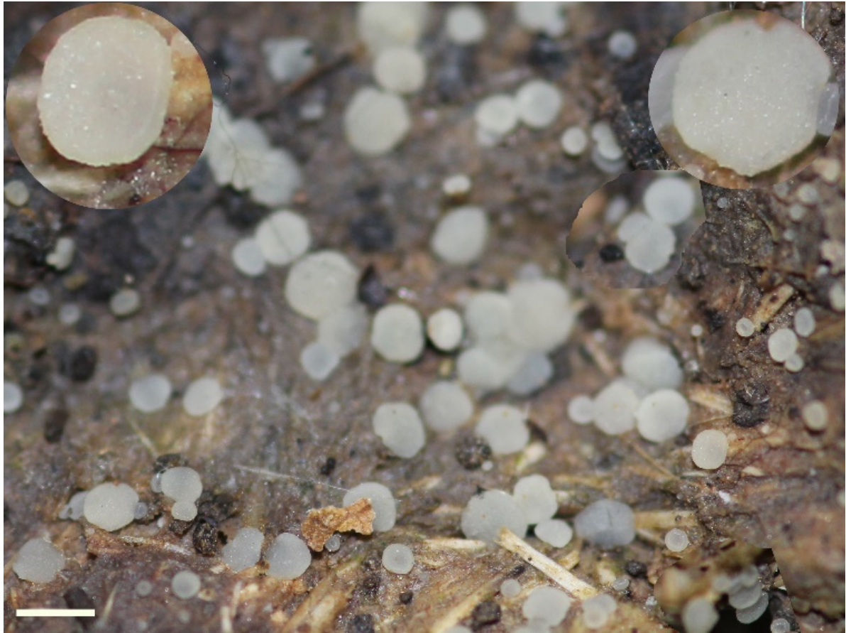
Figure 1. Fresh ascomata of Coprotus disculus . Scale bar = 1 mm

Specimen Examined: TÜRKİYE, Hakkâri, Şemdinli, Derya village input, 37° 21'271"N, 44° 31'282"E, 1525 m, on the dung of cow, 28.03.2018, VANF Acar. 1014.