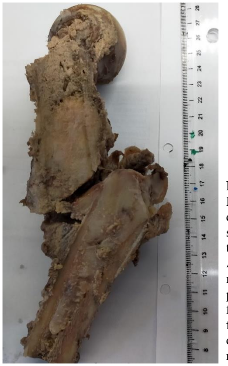
Figure 2. Metastatic dedifferentiated solitary fibrous tumor. A gray-white mass with a pathological fracture in the femoral diaphyseal region is seen