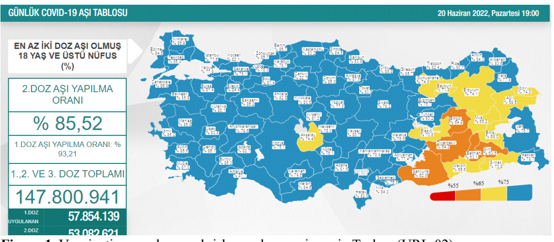
Figure 1. Vaccination numbers and risk map by provinces in Turkey (URL-02)

It is not possible to say that the covid-19 pandemic has completely ended worldwide. It continues with new mutations (Figure 2). Although, depending on the immune mechanism in humans, the depth disappears as much as in previous periods, but it is not exactly known what new mutations may cause.