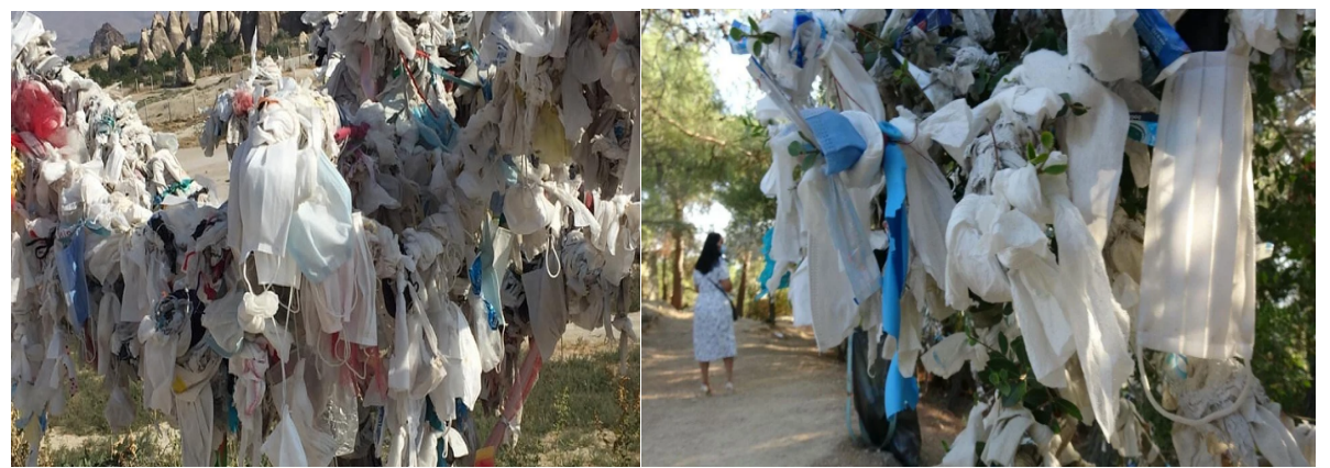
Figure 5. They hung a mask on the 'wish tree' in Cappadocia and 'Wish trees' filled with fun masks at Zeus Altar

With COVID-19, sustainable healthcare medical waste management is more important than ever to protect communities, healthcare workers and the planet and prevent pollution. Of the 127.4 million tons of waste processed in waste disposal and recycling facilities in Turkey, 78.3 million tons are disposed of and 49.1 million tons are recovered solid wastes. The number of total wastes were processed increased by about 22% during the pandemic period compared to 2018. While protection materials should be disposed of, unfortunately, it is even seen that personal protection masks are hung in some historical areas for superstitions in a way that can be said ridiculous in Turkey (Figure 5).