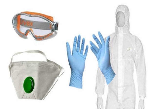
Figure 3. Face mask and gloves and other protection materials.