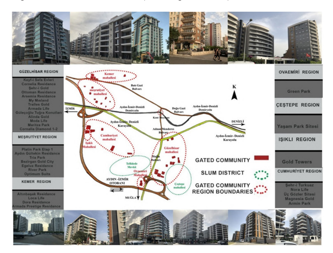
Figure 2. The Current Gated Community Location in Aydın

been replaced by the elements of modern architecture. Therefore, the spatial settlement features of the man-made place cannot be explained around a single fact or feature; it has a complex image with many features and elements.