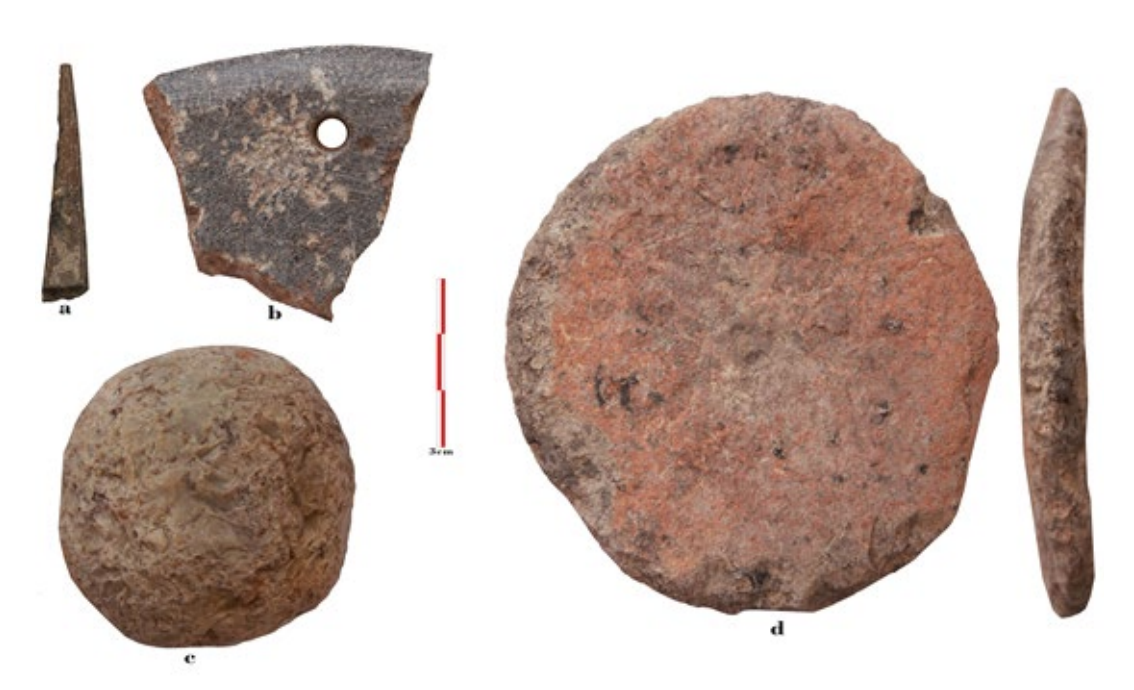
Figure 7. Other finds (a: bone tool (awl), b: stone vessel fragment, c: flint hammer and d: oval plate)

Considering the cultural materials recovered, the bone tool industry is scarce in Yusufun Kayası Cave. The only example of a bone tool recovered from excavation was an awl, darkened by fire. Its pointed end is broken, presumably from use, resulting in its discard (Fig.7a).