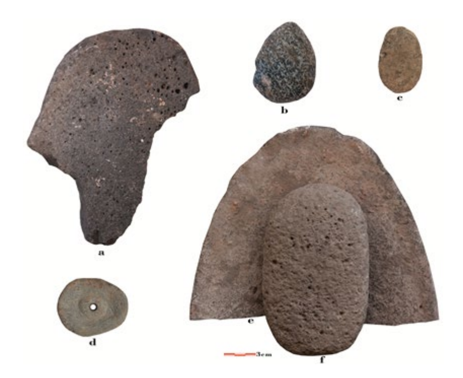
Figure 5. Ground stone samples (a: basalt grinding stone (bottom), b: serpentine grinding stone (top), c: upper grinding stone, d: disc-shaped perforated weight, e-f: lower-top grinding stone)