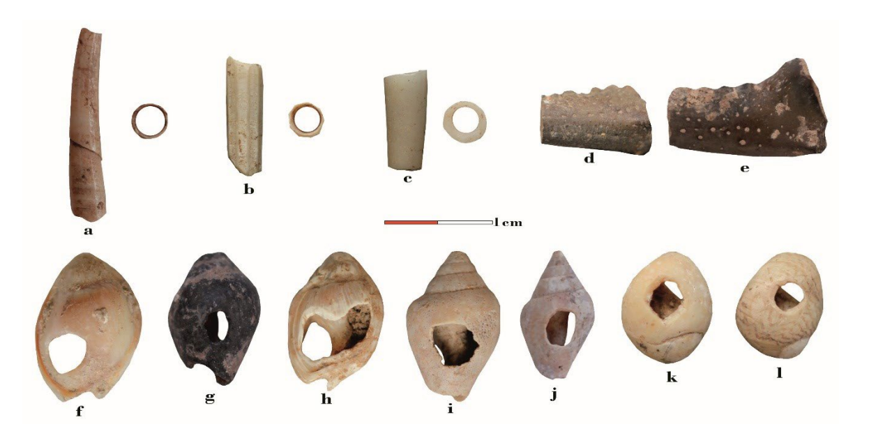
Figure 6. Various ornamental objects (a-c: dentalium, d-e: pedipalps (pincers of scorpion or crab) pieces with both ends cut off., f-h: Nassarius, i-j: Columbella and k-l: Theodoxus)