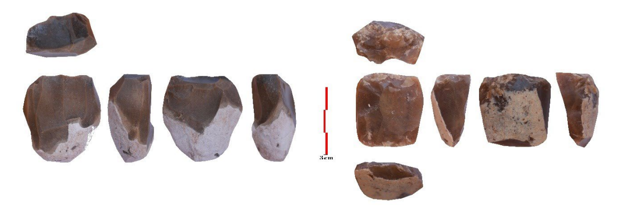
Figure 3. Example of a core with a single striking (left) and a double striking platforms (right)

Other identifiable tools types include end scrapers, denticulated, denticulated-notched tools, and stone drills. Retouched flakes, blades and bladelets, which can be defined as ad hoc tools, are the most crowded tool group after microliths. Apart from these, backed and truncated pieces and points considered as weapons were also found. In addition, silica glossing was observed in two of the retouched flake and blade tools in the find group