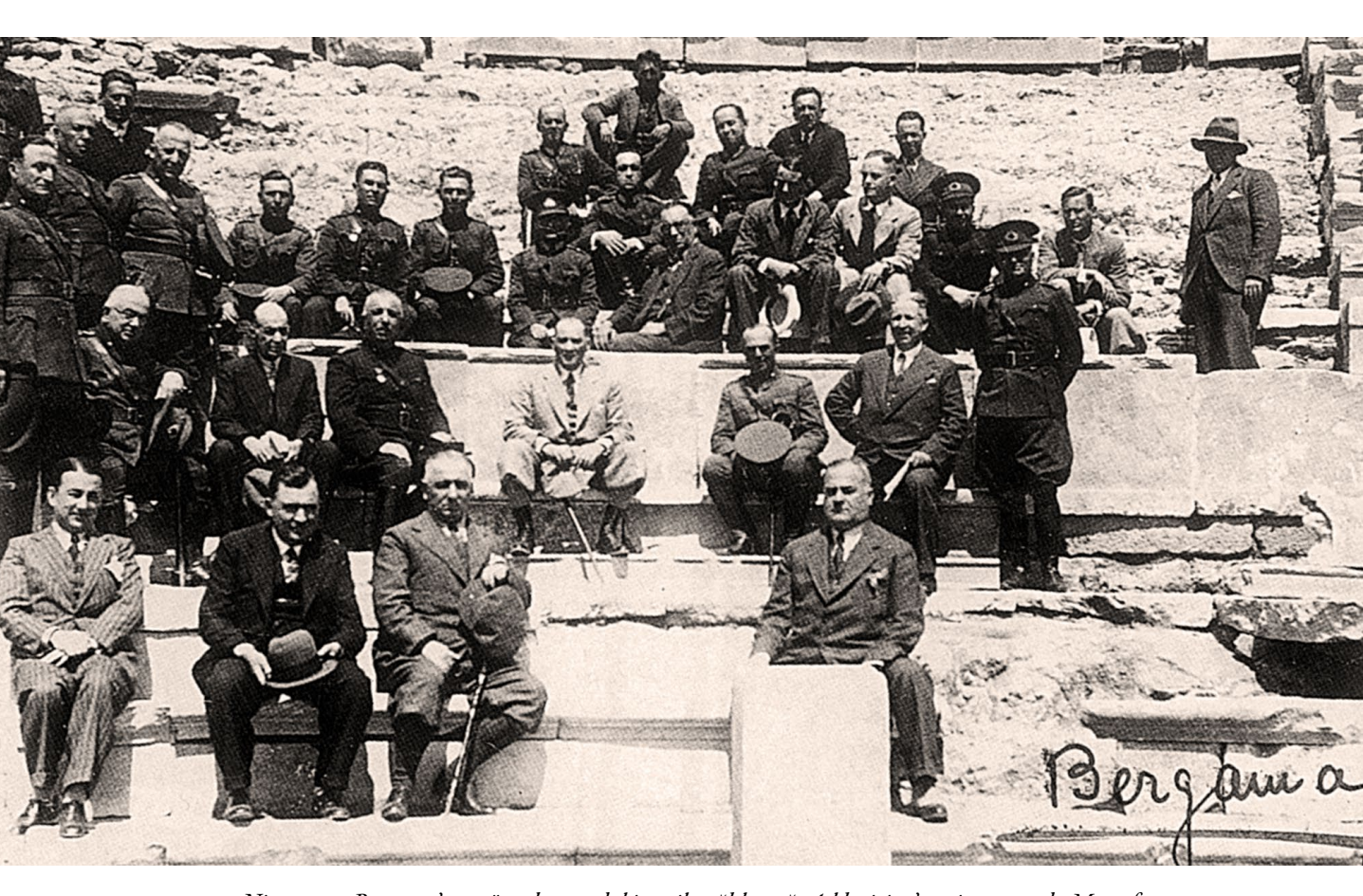
13 Nisan 1934 Bergama'nın güneybatısındaki antik sağlık ocağı Asklepieion'un tiyatrosunda Mustafa Kemal Atatürk ve beraberindekiler.