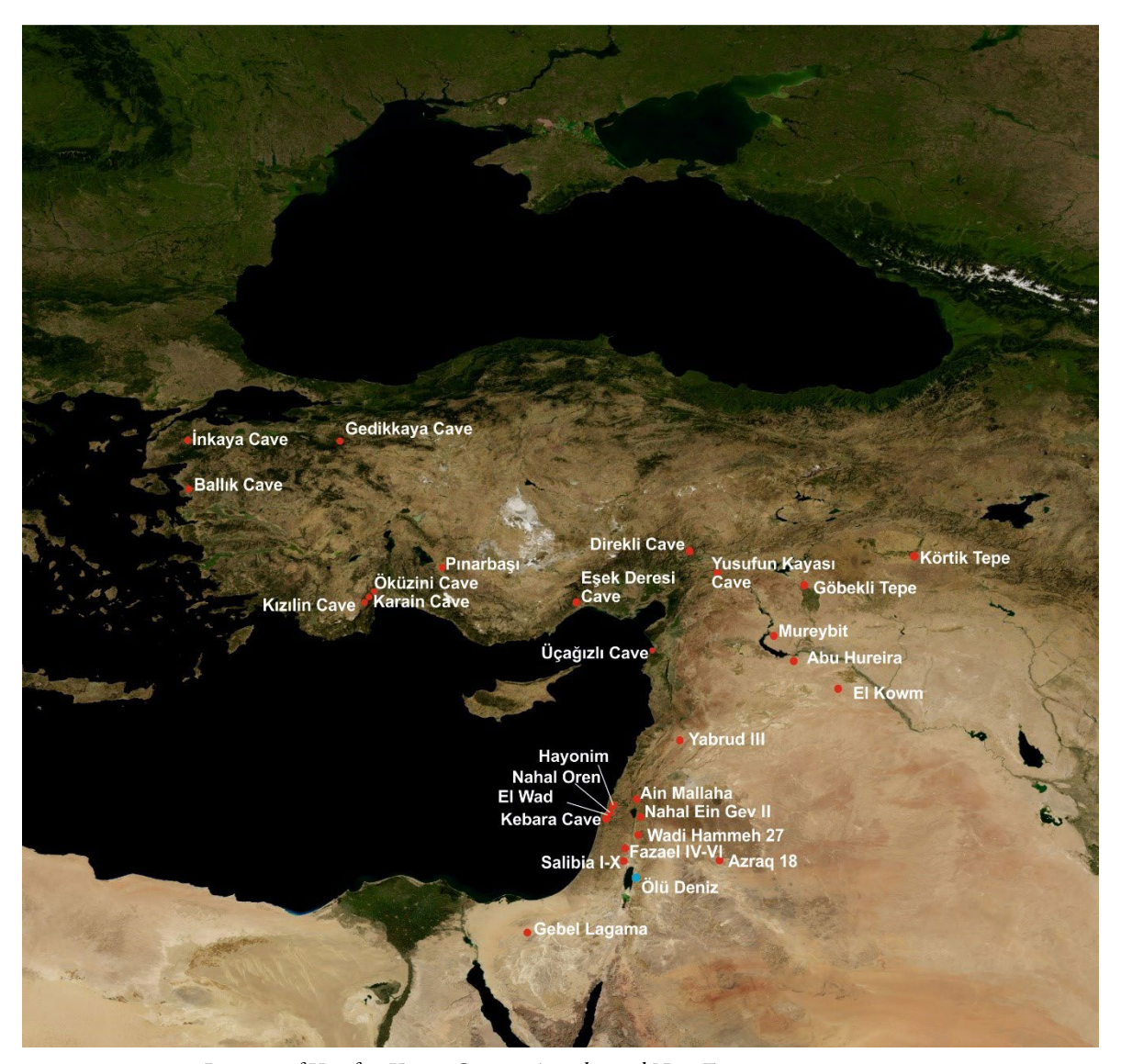
Figure 1. Location of Yusufun Kayası Cave in Anatolia and Near East

that Direkli Cave is associated with a lithic industry with Early Natufian characteristics. On the other hand, Eşek Deresi (Altınbilek-Algül vd. 2022) and Yusufun Kayası Caves are still new excavations, so it is too early to describe a specific typological affiliation. However, both have material evidence reflecting distinct periods that differ from each other in some significant ways. At this point, Yusufun Kayası Cave appears as a reflection of a unique regional adaptation due to its location and cultural materials.