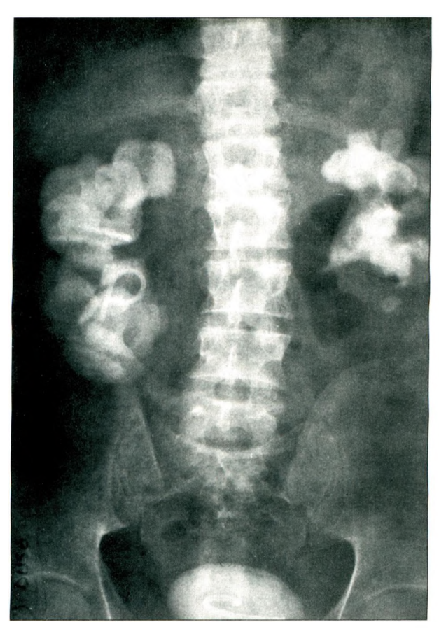
Fig.1: Fragmented forgotten ureteral stent for 9 years with bilateral staghorn stones and a huge bladder stone.

Case 2: A 40-year-old-man attended with right flank pain. He received ESWL treatment for kidney stone including a ureteral stent replacement 11 years ago. Plain film demonstrated right renal stones and a calcified stent throughout the ureter (Fig. 2). Scintigraphy revealed a relatively preserved function of the right kidney. Endoscopic attempts failed to remove the stent. Therefore, open surgery was performed and parts of the stent could be taken out through 2 separate skin incisions with several accesses to urinary system as pelvis, bladder, and 2 distinct ureteral incisions. A new stent was replaced. He recovered from surgery well and the stent was removed after 1 month.