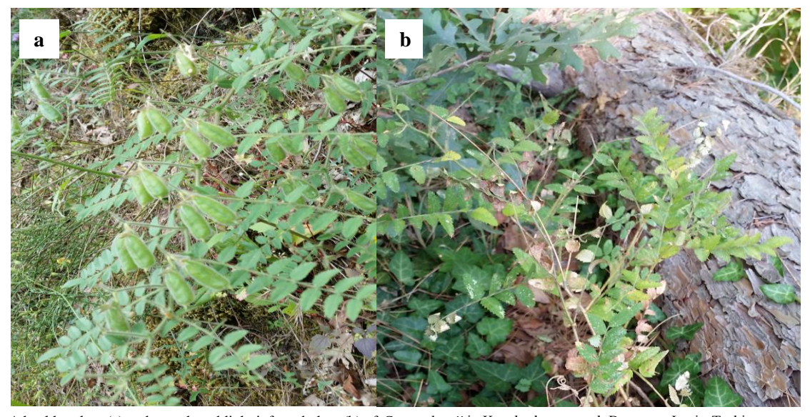
Figure 1. A healthy plant (a) and ascochyta blight infected plant (b) of C. montbretii in Kozak plateau road, Bergama, Izmir, Türkiye.

Plant samples of C. montbretii were collected in Kozak plateau, Bergama, Izmir in 2017 (Figure 1-2). Plant samples and infected plant parts were collected every 100 m and were controlled, respectively.