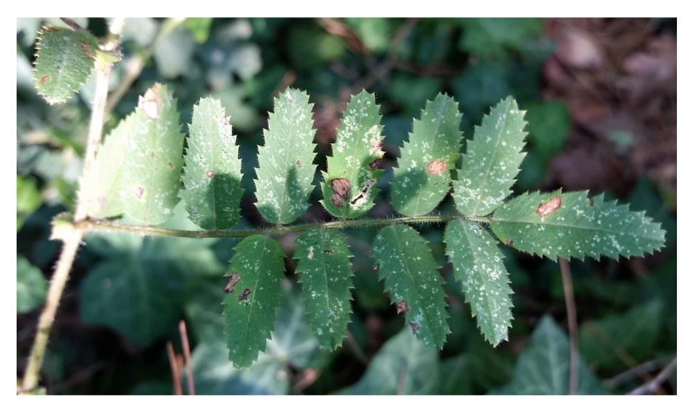
Figure 2. Ascochyta blight on leaf and leaflets of C. montbretii in Kozak plateau road, Bergama, Izmir, Türkiye.