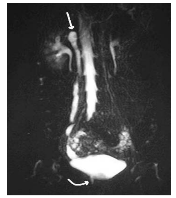
Figure 2: Ectopic upper pole kidney (straight arrow) and termination of the ectopic ureter (curve arrow) were shown by MRU.

prominent bundles of smooth muscle (Figure 4). There were no immature glomeruli. Cyst formation was not evident. The dysplastic segments were separated by areas of normally developed renal tissue with focal chronic pyelonephritis. Inflammation was present in one dysplastic area adjacent to focal chronic pyelonephritis. Dysplastic segments involved 24 % of renal parenchyma. Findings were compatible with focal solid (non-cystic) renal dysplasia.