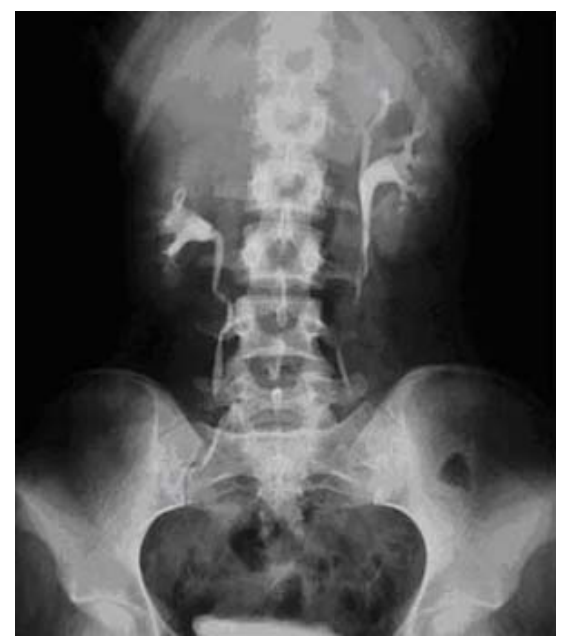
Figure 1: IVP revealed a single collecting system on the right kidney and a duplex collecting system on the left kidney.

since early childhood. The physical examination was normal except for a moist genital area. IVP suggested complete ureteral duplication at the left side and a single collecting system at the right side (Figure 1). cystourethrography revealed a Voiding normal urinary bladder and urethra without vesicoureteral reflux. On cystoscopy, a single right ureteral orifice and two left ureteral orifices were visualized. The urodynamic examination was found to be normal. Suspecting an ectopic system which was not vet visible, the patient underwent MRU showing a bilateral ureteral duplication and a right ectopic ureter and opening into the posterior vaginal fornix (Figure 2).