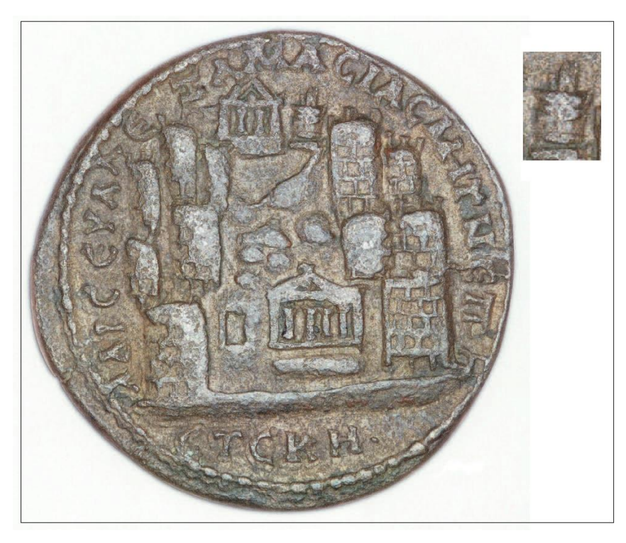
Figure 3: Bronze coin minted in Amasya and detail of the fire altar (After Dönmez, 2013).