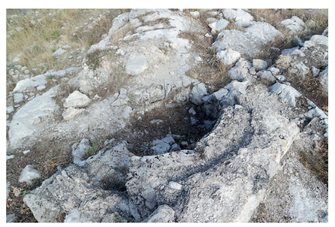
Figure 2: Round-shaped pedestal cavity from Amasya-Harşena Fortress (After Dönmez, 2013).