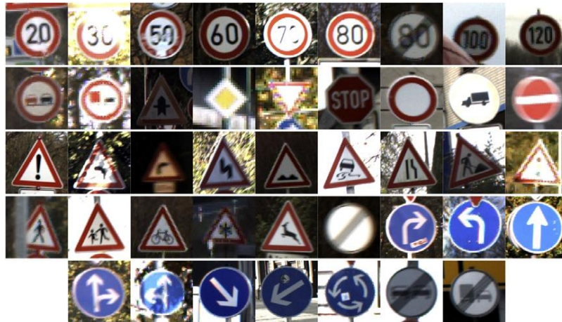
Figure 2. Random example representatives of 43 classes in GTSRB Dataset [4].

Based on the serial development of computer vision systems, derived new methods enable accurately classifying complex objects. Classification of traffic signs seems basic because of their shapes or colors but it has a complex challenge concerning environmental items [5]. The main problems in that matter like bad conditions, low image quality, image blurring, and the same image color between the environment and traffic signs, etc.