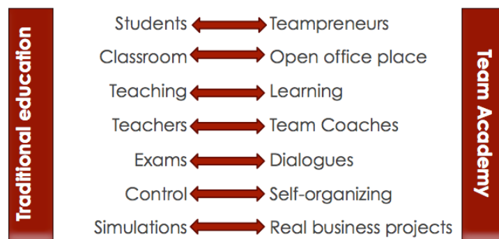
Figure-3: Differences between traditional education and TA