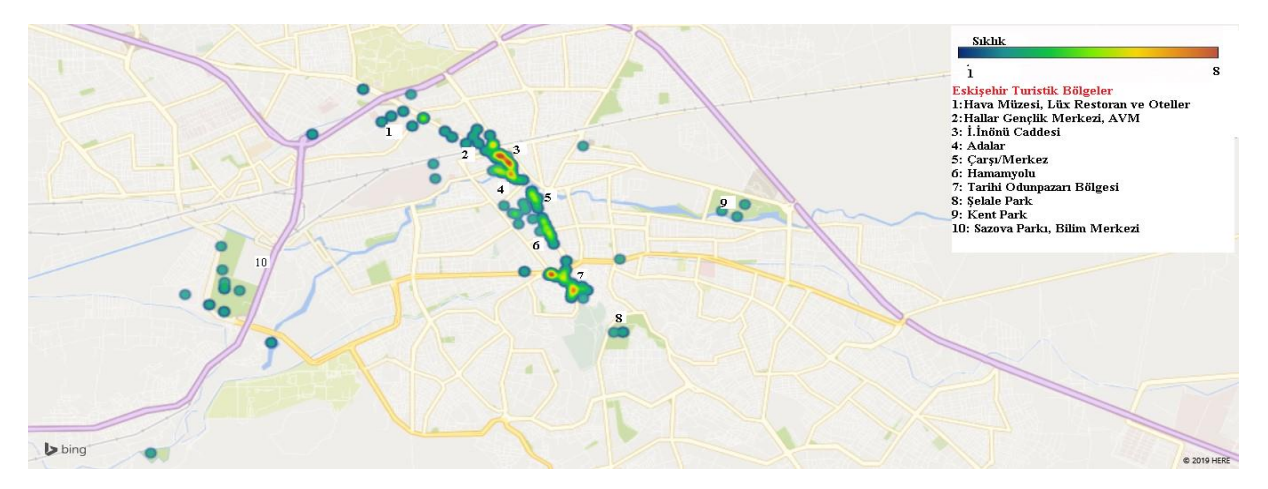
Figure 1. Eskisehir Province Touristic Attractions Heat Map

Known as the city of firsts in Turkey, Eskisehir has attracted a lot of attention in recent years with its modern life and its cultural and historical richness from the past. With the development of transportation opportunities, Eskisehir has become a city that can be reached more easily, especially with high-speed train services. In Picture 1, the heat map of the regions with touristic attractions of Eskisehir is shown. These attractions are prepared according to city maps and brochures showing touristic values.