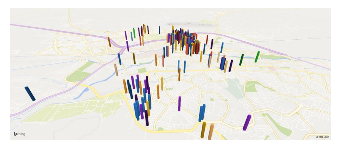
Figure 3. Eskisehir Airbnb Price Ranges

The hosts intervene in the prices after the first guest's stay and first examine the prices of the houses in the vicinity and make pricing. To the question of how you determine the price of H13's house, she replied, "Airbnb does not allow you to enter a price for the first use anyway. However, in subsequent uses, I determine the price of my house according to the Airbnb houses around me."