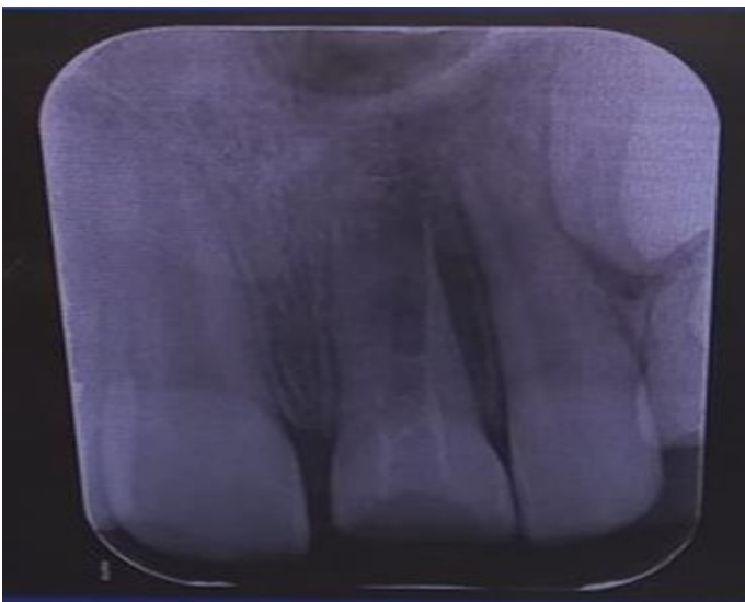
Figure 5. Radiographic image taken after calcination in the 2nd session