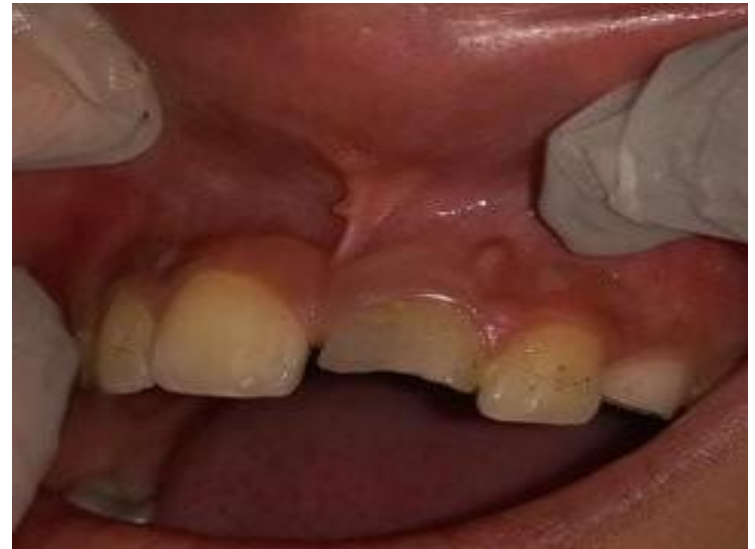
Figure 7. The clinical image taken before the treatment in the 3rd session