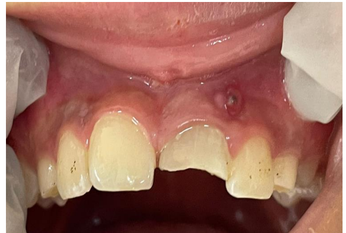
Figure 2. Clinical image taken before

In the session 1 month later, it was observed that there was no pain on percussion and palpation in tooth 21 and the fistula tract was closed. The root canal was washed with 2 ml of 2.5% NaOCl solution to remove the calcium hydroxide and smear layer in the canal. Root development was checked by taking a periapical film. After adequate irrigation, it was temporarily resealed with glass ionomer cement (Figure 4-5).