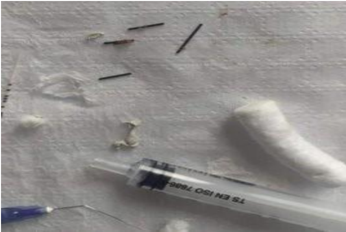
Figure 3. Pen tip pieces that came out of the canal the as a result of irrigation in the 1st session