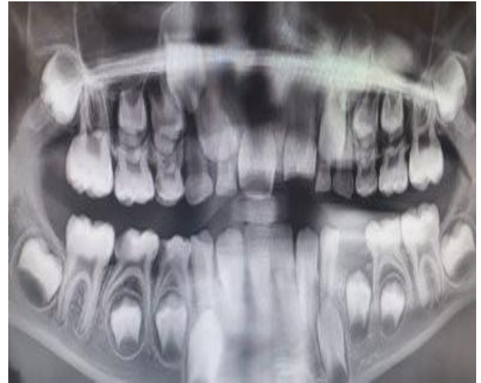
Figure 1. Radiographic image taken before treatment

Informed consent was obtained from the parents, and treatment was started. It was decided to treat tooth 21 with \text{Ca}(\text{OH})_2 apexification. Since the pulp exposure area was large in the first session, irrigation with 2.5% sodium hypochlorite was started. During irrigation, the pen tip pieces were removed from the exposure area. (Figure 3) After adequate irrigation, the root canal was dried with sterile paper cones and filled with calcium hydroxide temporary canal sealer (Kalsin, Turkey) and temporarily filled with glass ionomer cement. (Kavitan Plus, Pentron, Czech Republic).