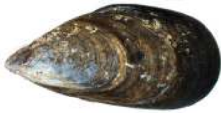
Fig. 1. Mytilus galloprovincialis (Mediterranean mussel) (URL 2)

Many of the bacteria algae and zooplankton captured by this filtration, sorting and selection process may still be viable even after passing completely through the gut, indicating that digestion of captured organisms is often incomplete in mussel. Since bivalves do not normally contain fecal coliform bacteria in their gut, the presence of such bacteria in a mussel is hypothesized to indicate a recent environmental exposure of the mussel to bacteria rather than to reflect their endogenous presence in the mussel ([8]; URL 1).