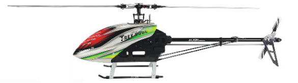
Figure 3. Radio controlled model helicopter.