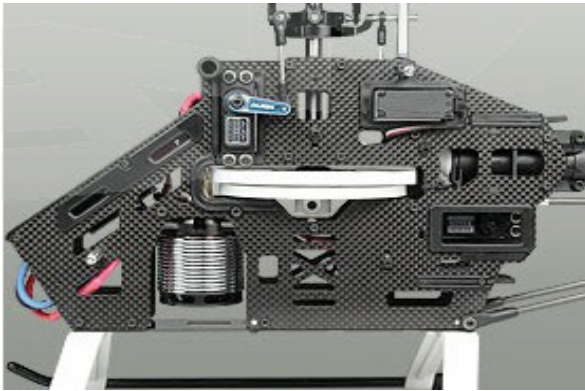
Figure 2. 2024-t3 Aluminium alloy chassis.

repeated for CREC material (Figure 4) on another radio controlled model helicopter.