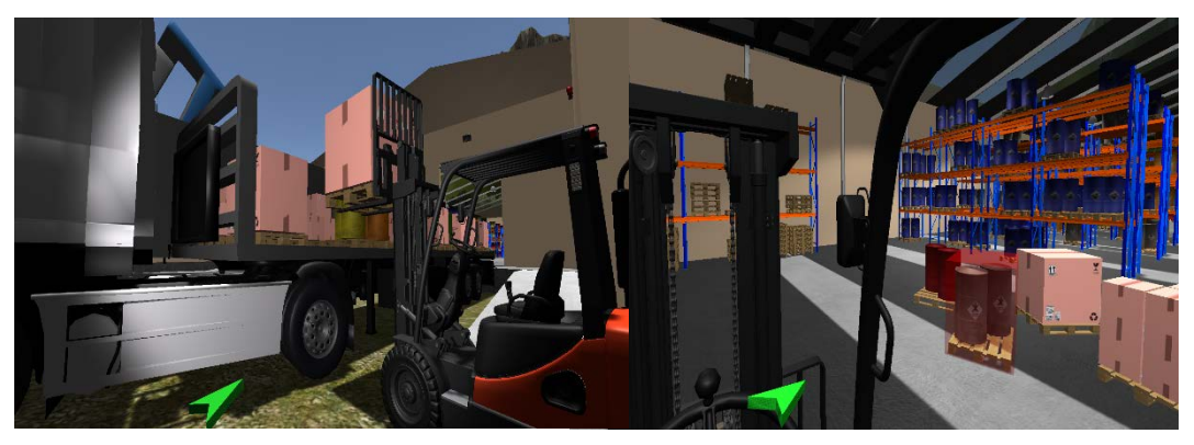
Figure 4: Screen capture of the receiving of the certificate in the OcuLift <sup>TM</sup> game