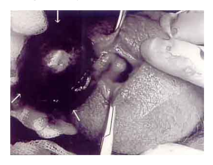
Figure 2: Scrotal exploration revealed torsion of the testis with 540°, all testis and epididymis were purple in color (arrows).