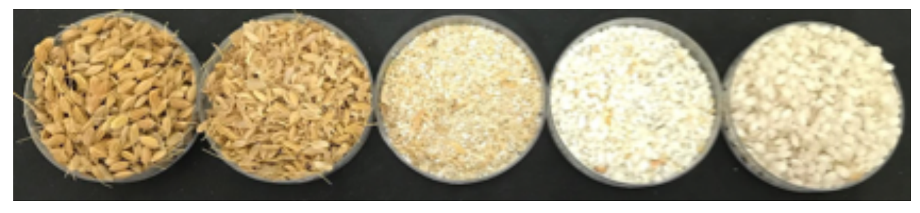
Figure 3. Rice color changes at different milling times.