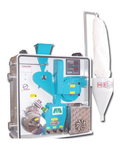
Figure 1. Rice Milling Machine

The experiments were carried on rice samples subjected to five different threshing cylinder speeds (650, 750, 850, 950, and 1050 rpm) in the combine harvester. The samples were taken from the threshed paddy for each cylinder speed, while four milling times (10, 15, 20 and 25 second) and four feed rates (20, 40, 60 and 80 gr) were used as independent parameters. The rice yield, broken kernel, bran rate, husking rate and change of color were measured for the different parameters.