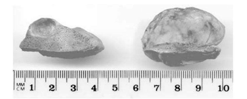
Fig. 1. Macroscopic appearance of cut surfaces of apical bullous lesions in two male smokers: the one on the left has a small bulla and mild emphysema, and the one on the right has a large bulla and prominent fibrosis