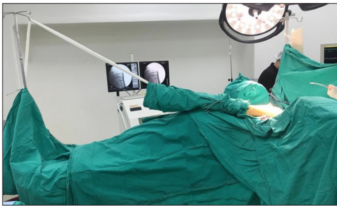
Figure 1. The operative arm is placed into the traction device and traction is applied with a 3 kg. Intraoperative view of patient positioning.

All patients were placed in a lateral decubitus position under general anesthesia. To keep the patient in a stable position, ventral and dorsal supports were used. To avoid pressure injuries, all bony points were padded. The operative extremity is wrapped in an elastic bandage with care being taken not to compress the hand to avoid any neurovascular complications. Then, the involved upper extremity was secured at 30 degrees of abduction and axial traction was performed with 3 kg hanging from the forearm to saline stand via a pulley. The C-arm was positioned medially and laterally to achieve the projection of the involved shoulder (Figure 1). The shoulder was draped in a sterile manner.