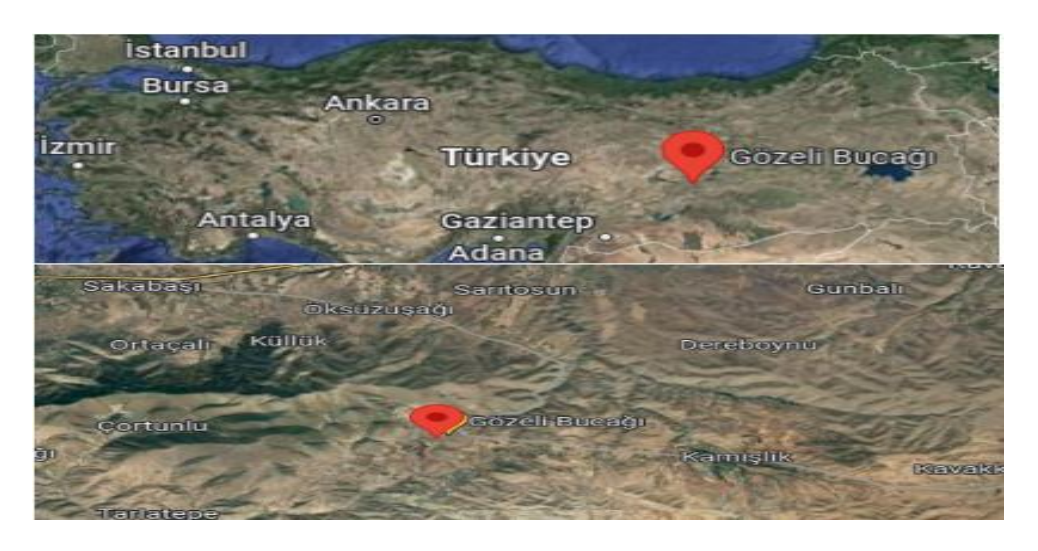
Figure 1. Distribution areas of plants and the region where they are collected in Turkey

Verbascum diversifolium Hochst., Alcea calvertii Boiss. species were collected from the roadside of the Gözeli plain during the flowering period of the plants. The region where it was collected is shown in Figure 1. The above-ground parts of the collected plant materials were dried in the shade. The aerial parts of the dried plant samples were extracted with a soxlet device using ethanol as a solvent [21]. Extraction was continued until the final extract was colorless. The ethanol content of the extracts obtained from the Soxlet device was removed in the evaporator and the dry extracts formed were stored at +4 °C.