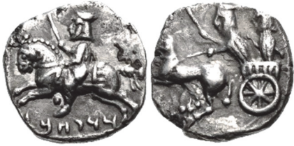
Fig. 3 (size 3:1)