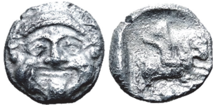
Fig. 1(size 3:1)