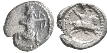
Fig. 4 (size 3:1)