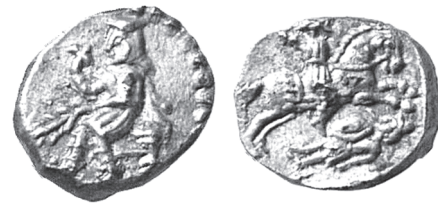
Fig. 8 (size 3:1)

Fig. 1. Samaria, unknown mint, ca 375-330 BCE, AR, obol / ma'eh © Roma Numismatics ltd, Auction XXII, 7 October 2021, lot 521