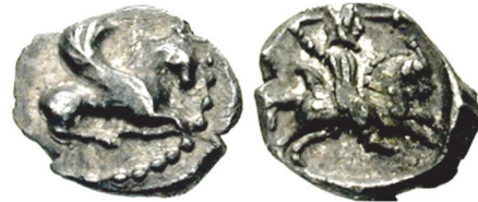
Fig. 6 (size 3:1)