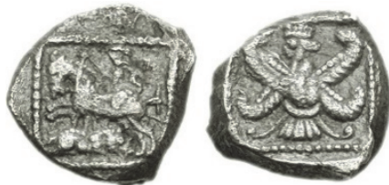
Fig. 7 (size 3:1)