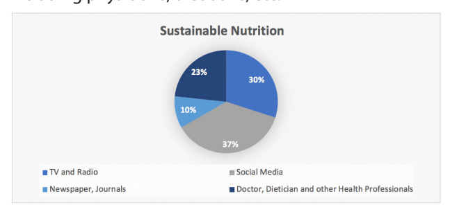
Figure 1. Source/Person/Place Where They Heard The Concept of Sustainable Nutrition

Regarding the question of whether they had ever heard of the term "sustainable nutrition", 32,6% (n:29) and 67,4% (n:60) of participants answered "yes" and "no", respectively. Figure 1 shows how subjects, who answered "yes" to the question, first encountered the term, sustainable nutrition. Accordingly, 37% (n:11) of housewives first heard of the term sustainable nutrition on social media, 30% from television and radio, and 23% first heard of the term from healthcare professionals including physicians, dietitians, etc.