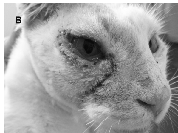
Figure 2. A) Reconstruction of defect with transposition full thickness flap technique in female cat. B) Appearance of the case, 2 weeks after the operation.