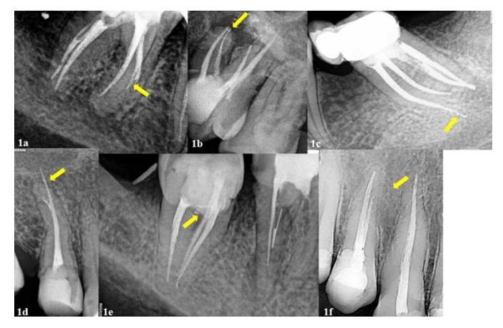
Figure 1. Some examples of iatrogenic errors in root canal treatment complications, 1a. Ledge; 1b. Broken instrument in the apical third of MB2 of an upper maxillary first molar; 1c. Overfilling; 1d. Transportation and apical perforation; 1e. Coronal perforation; 1f. Underfilling.

evaluated according to the adaptation of sealer and gutta percha to root canal walls. Completed RCT was classified as inadequate when it included any of the following in the final radiograph (Figure 1).