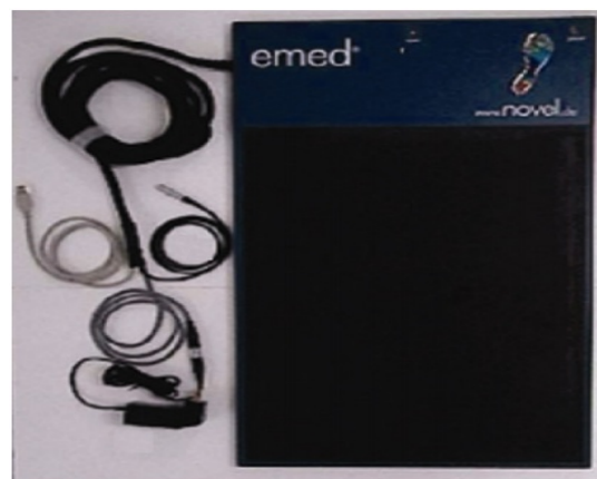
Figure 1. The emed platform.

the informed consent. Subjects were asked to remain as motionless as possible during single-leg stance on the pressure plate for 30s. They should lift their non-test foot, while the thigh angle was about 0 and the knee angle was about 90°, and hands placed on pelvis. The patient was asked to stare a point marked on the opposite wall and to keep his condition during the test. Prior to the test they performed two 15s practice trails, then subjects carried out 30s testing trails with 20s resting time between each trail. Test was repeated 3 times if subjects touchdown or stepped with the non-test foot were omitted. We also used a pressure platform (emed-C50, novel GmbH, Munich, Germany) was used which has a resolution of 4sensors/cm 2 , accuracy \pm 5\% and sampling rate of 50 Hz for measuring the COP data (Figure 1).