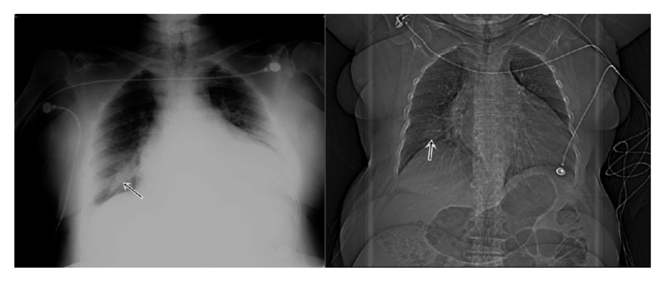
Figure 1: Chest radiography and computed tomography scan: cardiomegaly and pulmonary paranchimal opacity in the middle and lower lobe thought as pulmonary hemorrhage.