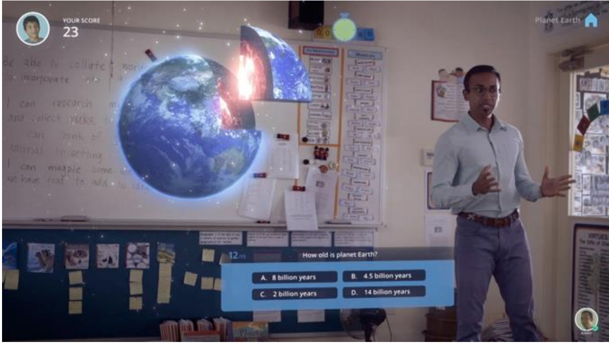
Figure 3. Augmented reality in education

the MR system reacts very quickly to the command to show the ventilation and cooling system of the jet engine and can instantly bring the desired design. There is no need to go to the hangar where that massive jet engine is located to receive this training. In addition, they do not divide those jet engines, which are very expensive, into parts for educational purposes and present them to the students' examinations. MR technology overcomes all these difficulties. Simulations such as all kinds of laboratory tests and examinations in the battlefields in history lessons will attract the students' attention, reduce the learning time and make learning easier (Özdemir and Öztürk, 2022).