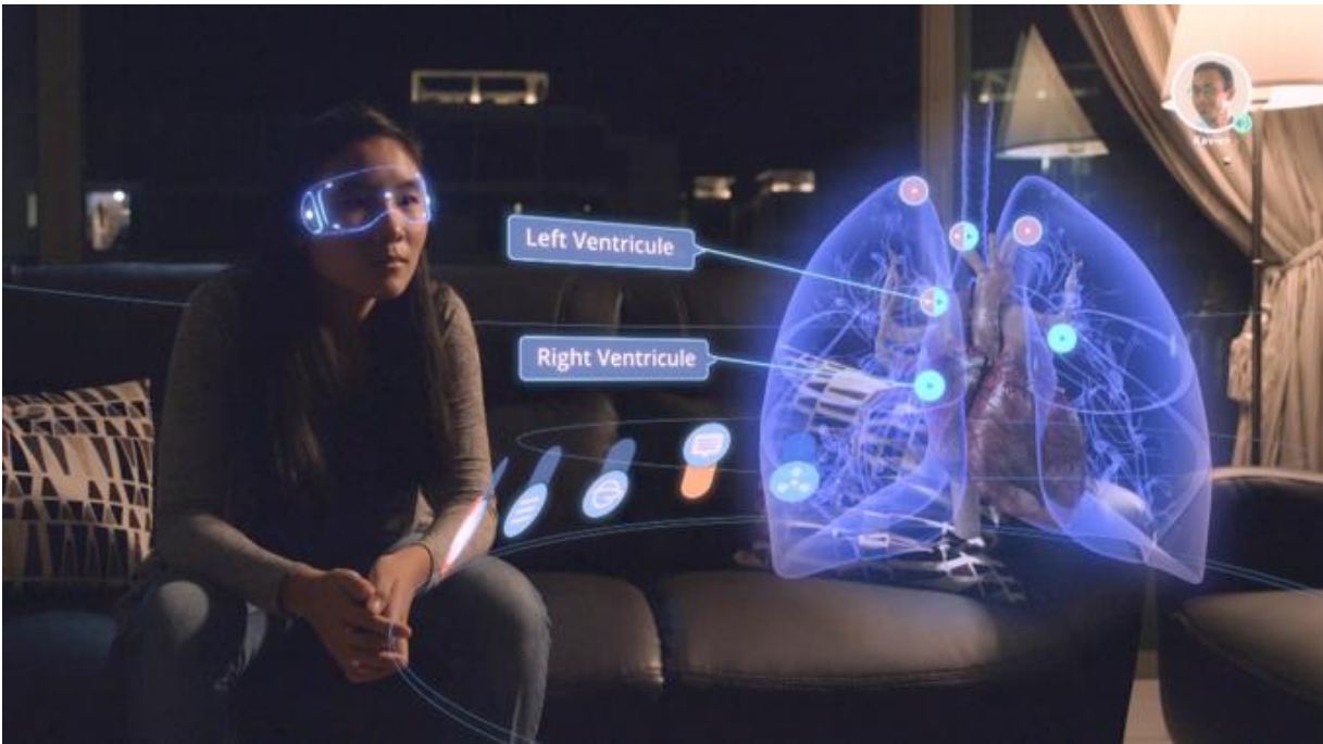
Figure 4. Augmented Reality in Medical Trainings Kaynak: (Cem, 2021)

Interaction in a VR environment is the most natural interaction type, and the participants were eager to use both MR and VR environments instead of an emulator (Ergün et al. , 2019). The most crucial feature that distinguishes MR applications from AR is the interaction of users with virtual images. Those in different places can see the product under development through their titles and provide and see the changes in real-time with the instructions they will give to the people who manage the project. Alternatively, imagine that the officials of an architectural office evaluate a project drawn with hologram technology with colleagues remotely from different parts of the world. While his Japanese colleague requested the elevator be relocated, the architect in America might want the balconies to be slightly more prominent. Such changes can be made instantly so that everyone can see them in 3D. All kinds of products can be produced error-free and optimal using similar applications during the development phase.