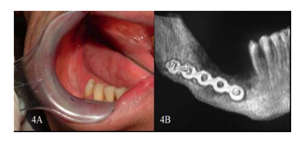
Figure 4. (A) Intraoral appearance of the patient 12 months after the surgery. (B) A three- dimensional CT scan after 12 months following the operation displaying complete bone union and no signs of recurrence of osteomyelitis.