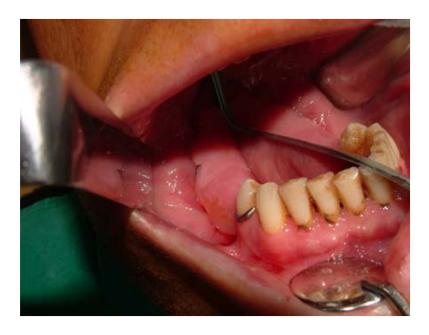
Figure 2. The view of the acrylic prosthetic that was applied to the surgical site.