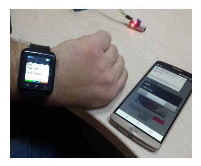
Figure 4. Smartphone and smartwatch screen for baby crying alarm