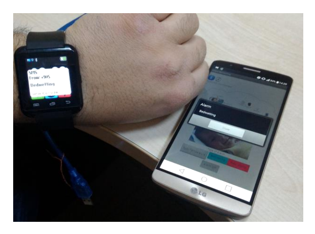
Figure 5. Smartphone and smartwatch screen for bedwetting alarm

As shown in Figure 4 and Figure 5, in the case of an alarm, the related button background color changes in the "Alarm Type" section, and the previously invisible "Alarm Off" button becomes visible. When the "Alarm Off" button is clicked, information related to closing the alarm is sent to the microcontroller via Bluetooth and the alarm is deactivated and the related led is turned off. In the application, the related button returns to the previous state and the "Alarm stop" button becomes invisible again. The aim of the notifications is to inform the parents in case of any alarm. According to the alarm, the parents can either treat the baby themselves or take it to a medical center.