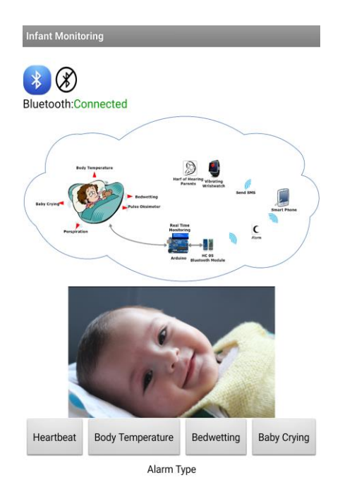
Figure 3. Android application user interface

We now introduce the android-based application, an important component of the developed system. Android is a mobile operating system developed by Google, based on the Linux kernel and designed mainly for touchscreen mobile devices such as smartphones and tablets. In this study, a user interface on the android-based application has been developed that performs several functions to notify the parents of alarm conditions. The android-based application was developed in the App Inventor web application. The prime advantage of the developed application is that it can work on all Android phones and not only just on a special phone. App Inventor for Android is an opensource web application originally provided by Google and now provided by the Massachusetts Institute of Technology (MIT) [18]. The android application is connected to Arduino Leonardo board via Bluetooth module. When it receives alarm information from the Arduino, the android application sends an SMS containing alarm information to the parents. At the same time, the phone vibrates and gives an alarm message for a second. The application user interface is shown in Figure 3.