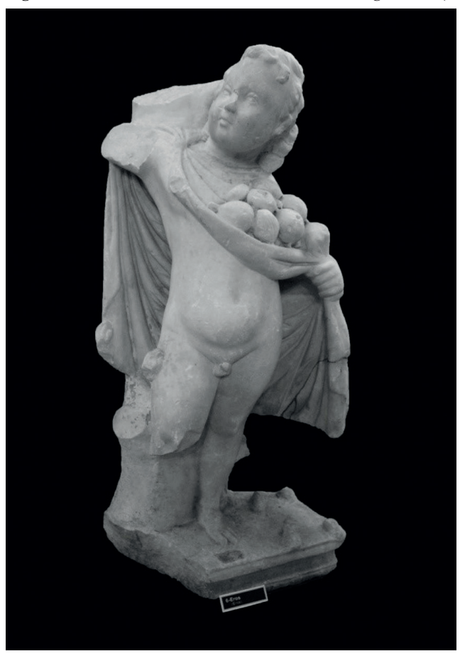
Figure 1-2: Front and back view / Önden ve arkadan görünüm (B.E. Sönmez).

located at the back of the pedestal, and a figure is added to the front. Often the column is complemented by a headboard to make the rectangular table more durable. It must have been formed in this sense in the circular area on the broken part of the Eros table support. Tables with legs in an enclosed space are often mounted in front of a wall to prevent tipping (Philips, 2008, p.253, figs. 3-4). The height of the table supports is about one meter, and their widths and depths are also close to each other. The area where the top of the table supports will sit on the table floor is clear. On some table supports, they have preserved the protrusion that will pass into the table floor (Anabolu, 1991, p.71).