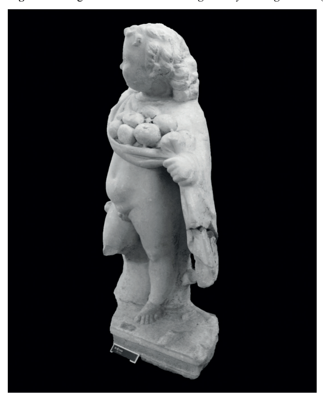
Figure 3-4: Right and left side view / Sağ ve sol yandan görünüm (B.E. Sönmez).

When we delve into the left hand and fruits carried in the chlamys of the young male, one more contradictory detail against the fruits carried only in the personifications of autumn of " tempora anni " illuminates. When we closely look at it, there are pomegranate, fig, walnut, and pine cone in the fruits and there is a bunch of grapes in the right hand. All of them are autumn fruits and related with the autumn (Gökdemir, 2019, p.117).