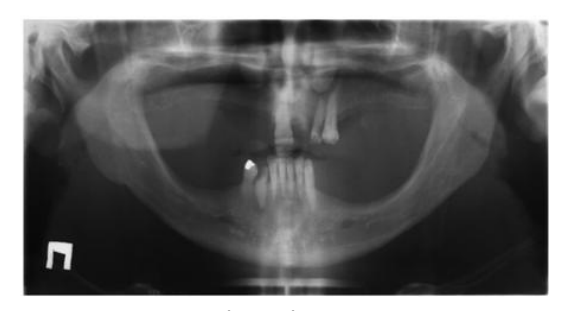
Fig. 4. Panoramic Radiography

Initial denture is polymerized with heat-cure acrylics (QC-20 Denture Base Material, Dentsply, Addlestone, United Kingtom). Initial placement, adjustment servicing of the denture is made. Then denture evaluated intraorally and adjusted (Fig.7 and 8).