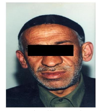
Fig. 1. It is showed largeness in the size of nose, ears, and lips.

In the extra oral examination, the size of nose, ears, lips (Fig. 1) and tongue were observed to be enlarged (Fig. 2) and growth in hands were seen (Fig. 3). There were a few teeth in the mouth, no diastema was seen.