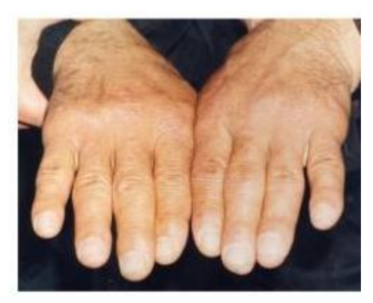
Fig. 3. It is showed growth in hands.

In the investigation of panoramic and cephalometric radiograms, an enlargement in the sella tursica and prognathism and obliquity in angulus mandible were observed (Fig. 4 and 5).