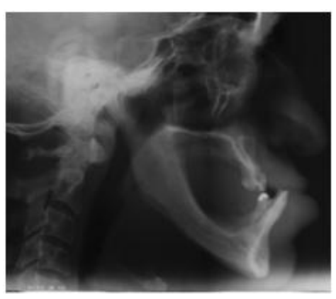
Fig. 5. In the cephalometric radiograms, an enlargement in the sella tursica and prognathism and obliquity in angulus mandibula were observed.