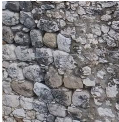
(d) Joint discharge