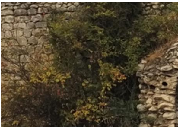
(a) Plant formation