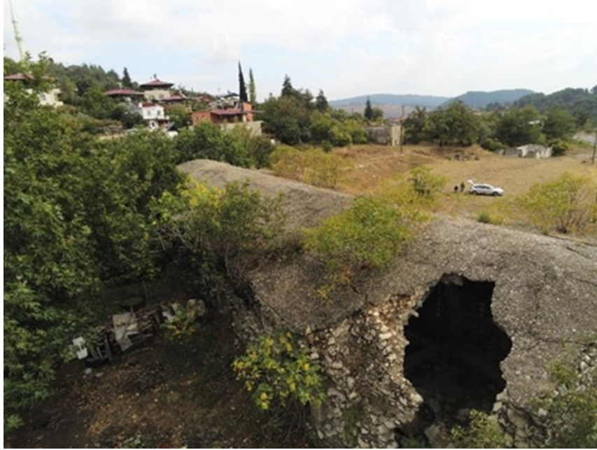
Figure 5. Fragment rupture