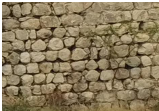
(b) Joint discharge