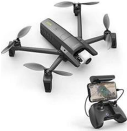
Figure 2. Anafi Parrot

in the field by the UAV photogrammetry method, the pictorial dictionary published by ICOMOS and the findings regarding the material deteriorations summarized in Table 2.