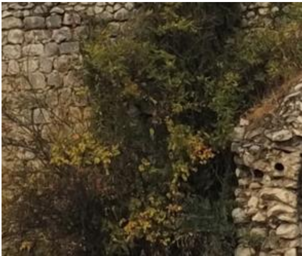
(a) Plant formation