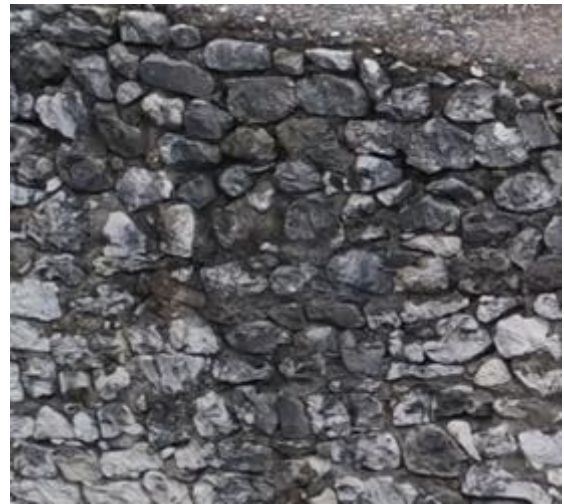
(b) Surface contamination